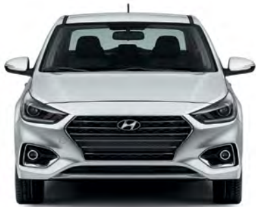
Overall width (excluding side mirrors)