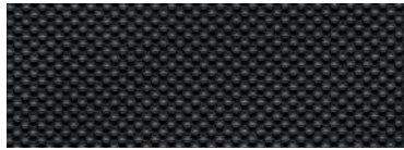
Black premium cloth Standard on 4-door Ultimate model