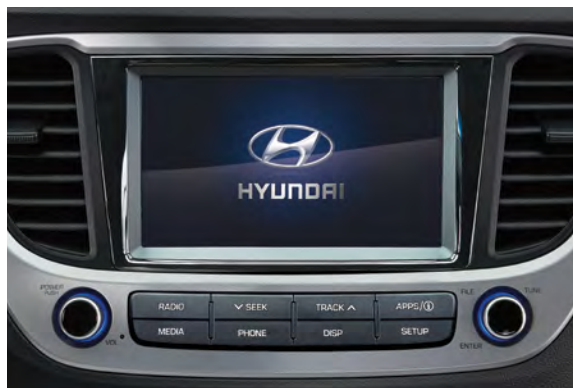
Available 7.0" touch-screen with Apple CarPlay TM and Android Auto TM