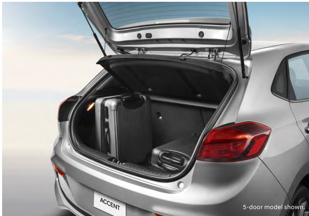
5-door model shown.

For those who prefer a hatchback design, the Accent 5-door model offers versatility and the same great styling.