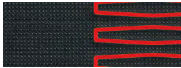
Black cloth/leatherette combination with red accents Available on 5-door Ultimate model (with automatic transmission only)