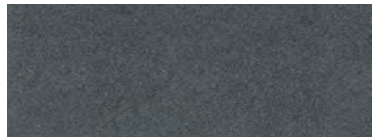
Urban Grey Not available on Essential model