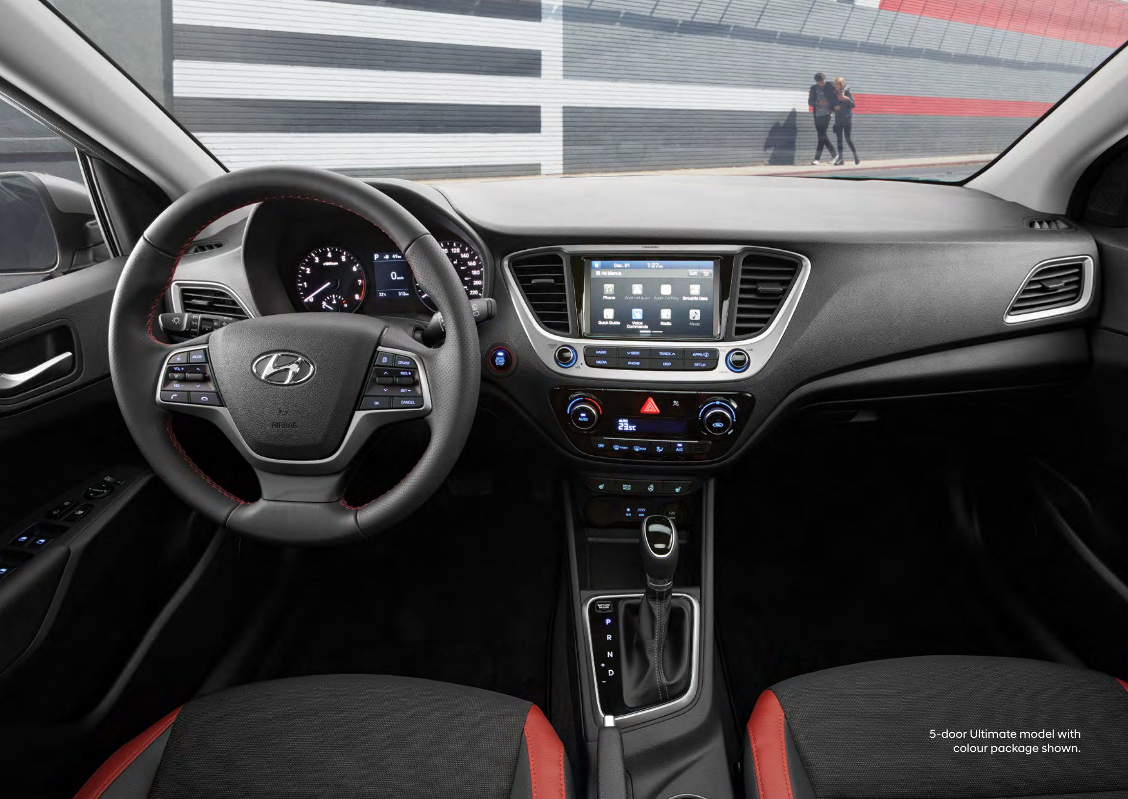
5-door Ultimate model with colour package shown.