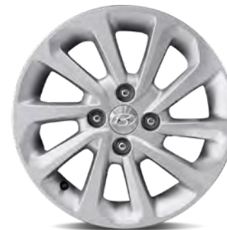
15" alloy wheel Standard on Preferred model