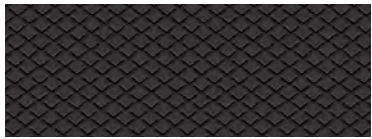
Black premium cloth Standard on 5-door Ultimate model