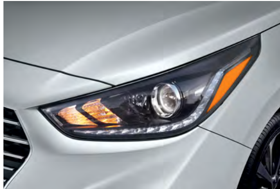
Available LED headlights

The Accent features our latest design signature, a bold cascading grille inspired by the flowing descent of molten steel. The assertive front profile features sculpted hood lines that complement the available LED headlights and daytime running lights that guide your way.