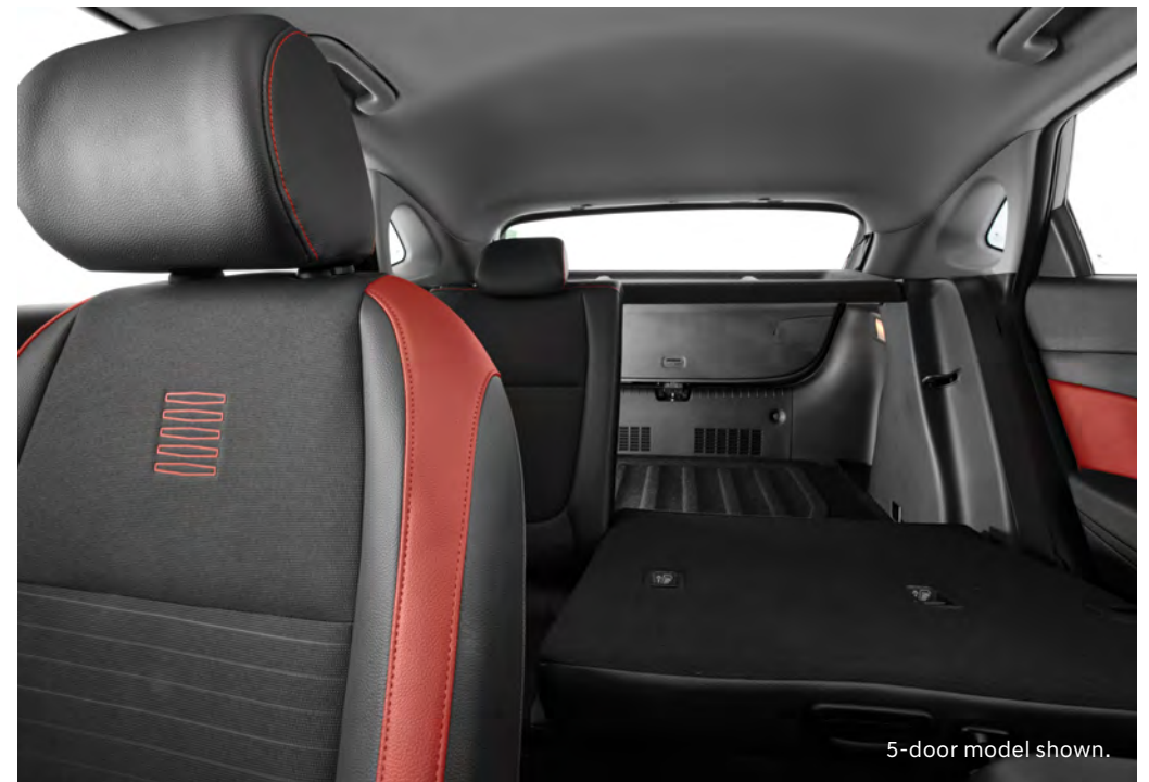
5-door model shown.

Class-leading cargo space of 616 litres means that you can enjoy more space than the Nissan Versa Note, Honda Fit, and even the Jeep Renegade.