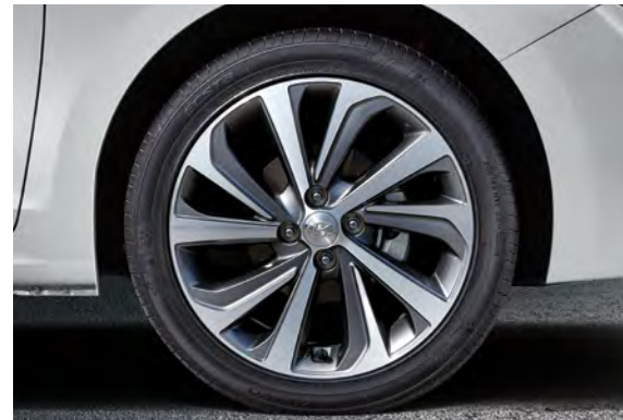
Available 17" alloy wheels