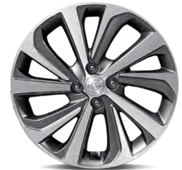
17" alloy wheel Standard on Ultimate model