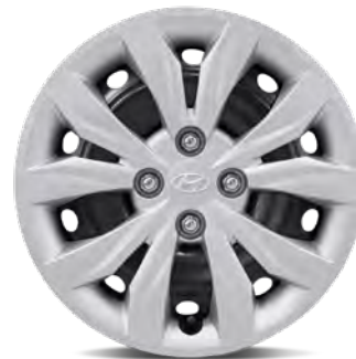
15" steel wheel Standard on Essential and Essential with Comfort Package models