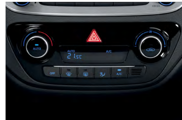
Available automatic climate control