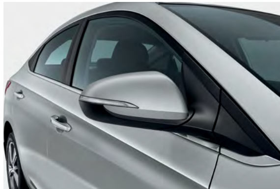
Available LED side repeaters