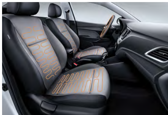
Available heated front seats and heated TM steering wheel