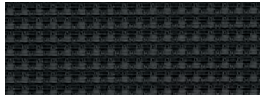
Black cloth Standard on 4-door Essential with Comfort Package and Preferred models Standard on 5-door Essential, Essential with Comfort Package and Preferred models