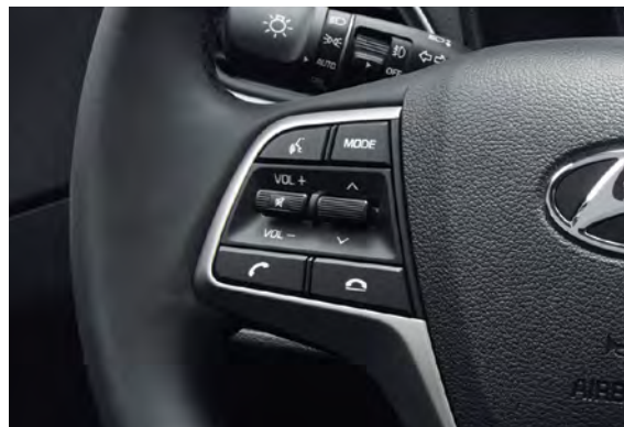
Available Bluetooth ® hands-free phone system