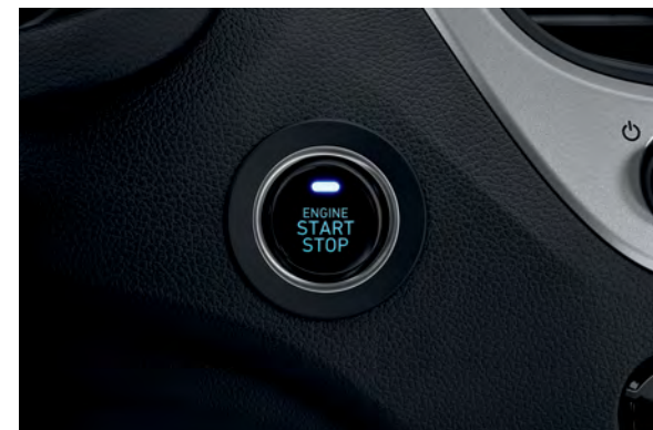
Available proximity keyless entry with push-button ignition