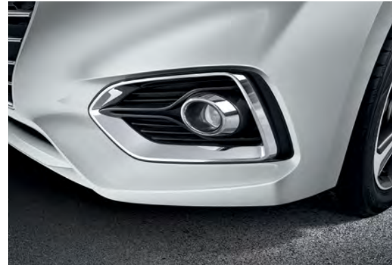
Available fog lights