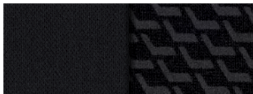
Black cloth Standard on Preferred and Luxury models