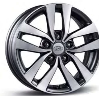
16" alloy wheel Standard on Preferred model