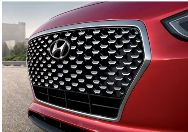
Bold cascading grille

Precisely sculpted surfaces, a tapering silhouette and expressive design details establish a sleek, simple sophistication. Muscular wheel arches provide a subtle hint of its eagerness to tackle the curviest of roads. This is a vehicle where you look for every opportunity to take the long way home, especially with the available panoramic sunroof to help soak in those weekend drives.