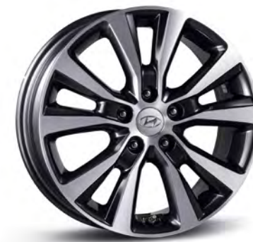
17" alloy wheel Standard on Luxury model