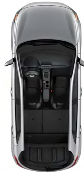
1,560 litres with rear seats folded down