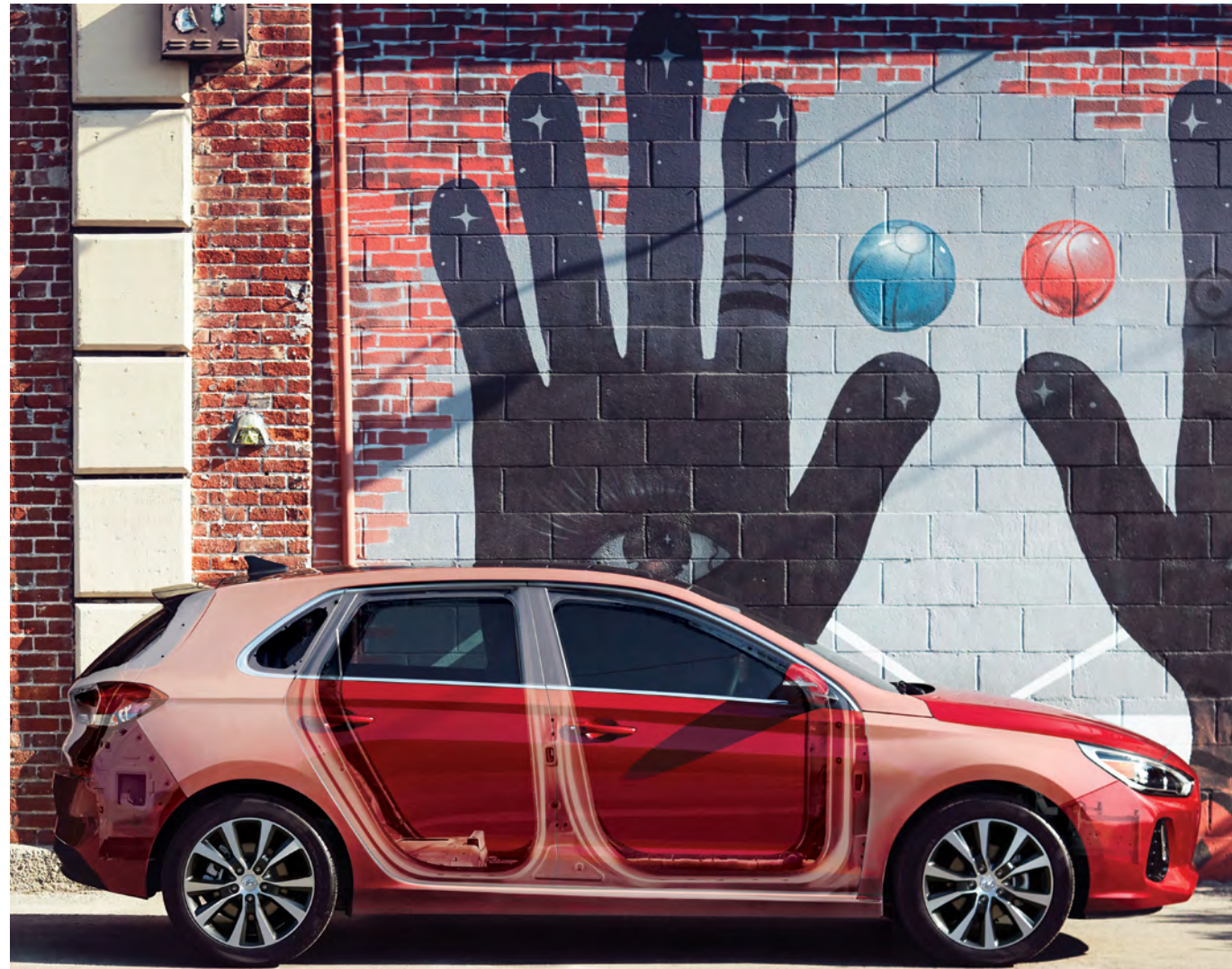
Elantra GT SUPERSTRUCTURE™ shown, made with our Advanced High-Strength Steel.