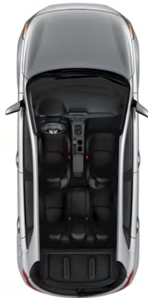
705 litres with rear seats up

Enjoy peace of mind when packing up for an adventure with the Elantra GT's ample cargo capacity. The generous interior space can be easily adapted thanks to the 60/40 split-fold rear seats to accommodate a rear-seat passenger and longer cargo items.