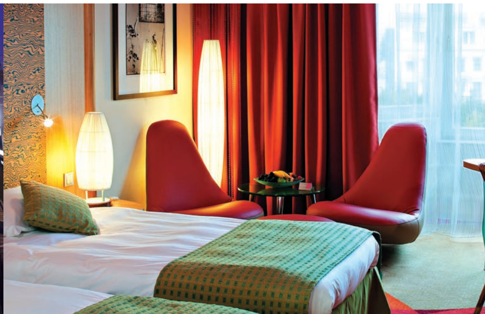
4-star accommodation at your luxury hotel in the center of Volvo's hometown. A great place to begin your European vacation.