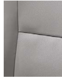
Platinum perforated leather in Graphite