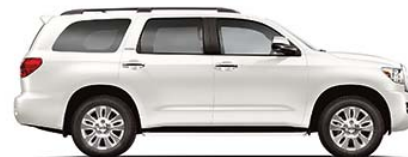
BLIZZARD PEARL 1,2 Graphite, Red Rock 1 or Sand Beige interior