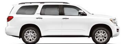
SUPER WHITE 3 Graphite or Sand Beige interior