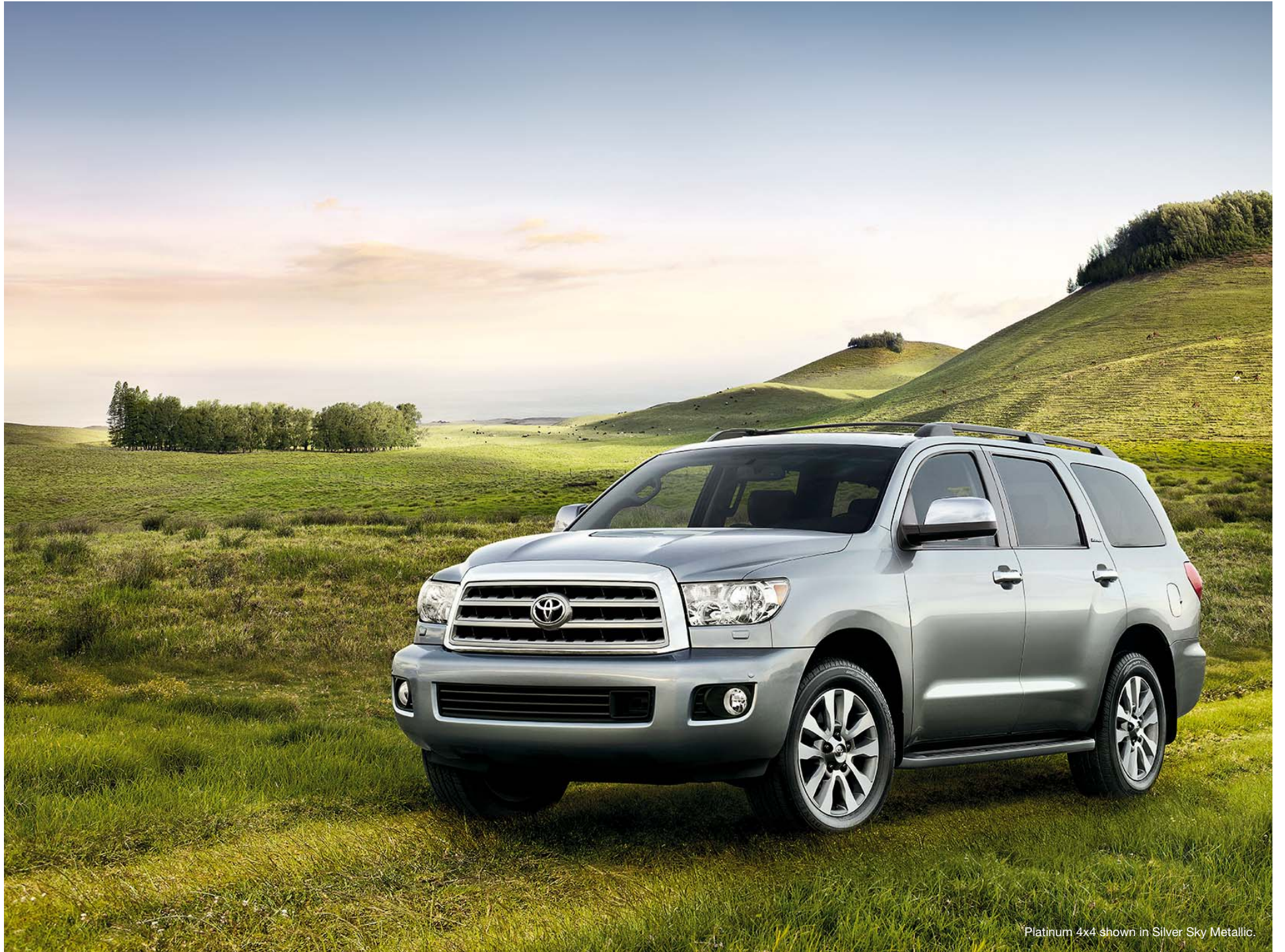
Platinum 4x4 shown in Silver Sky Metallic.