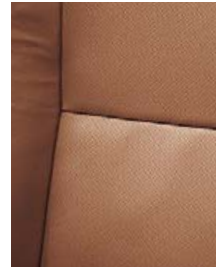
Platinum perforated leather in Red Rock