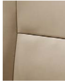
Limited leather in Sand Beige