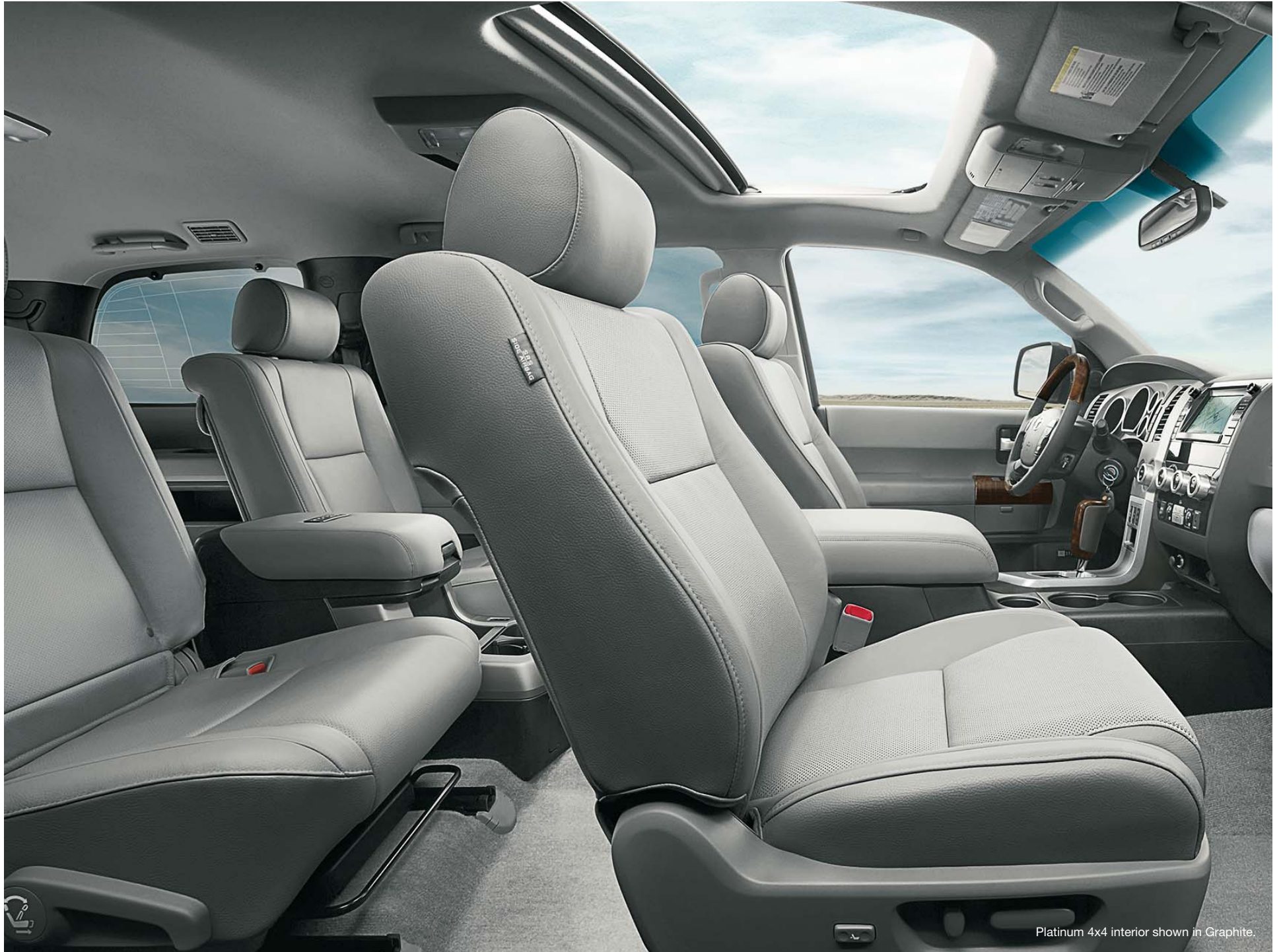
Platinum 4x4 interior shown in Graphite.