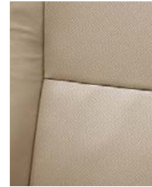
Platinum perforated leather in Sand Beige