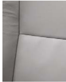
Limited leather in Graphite