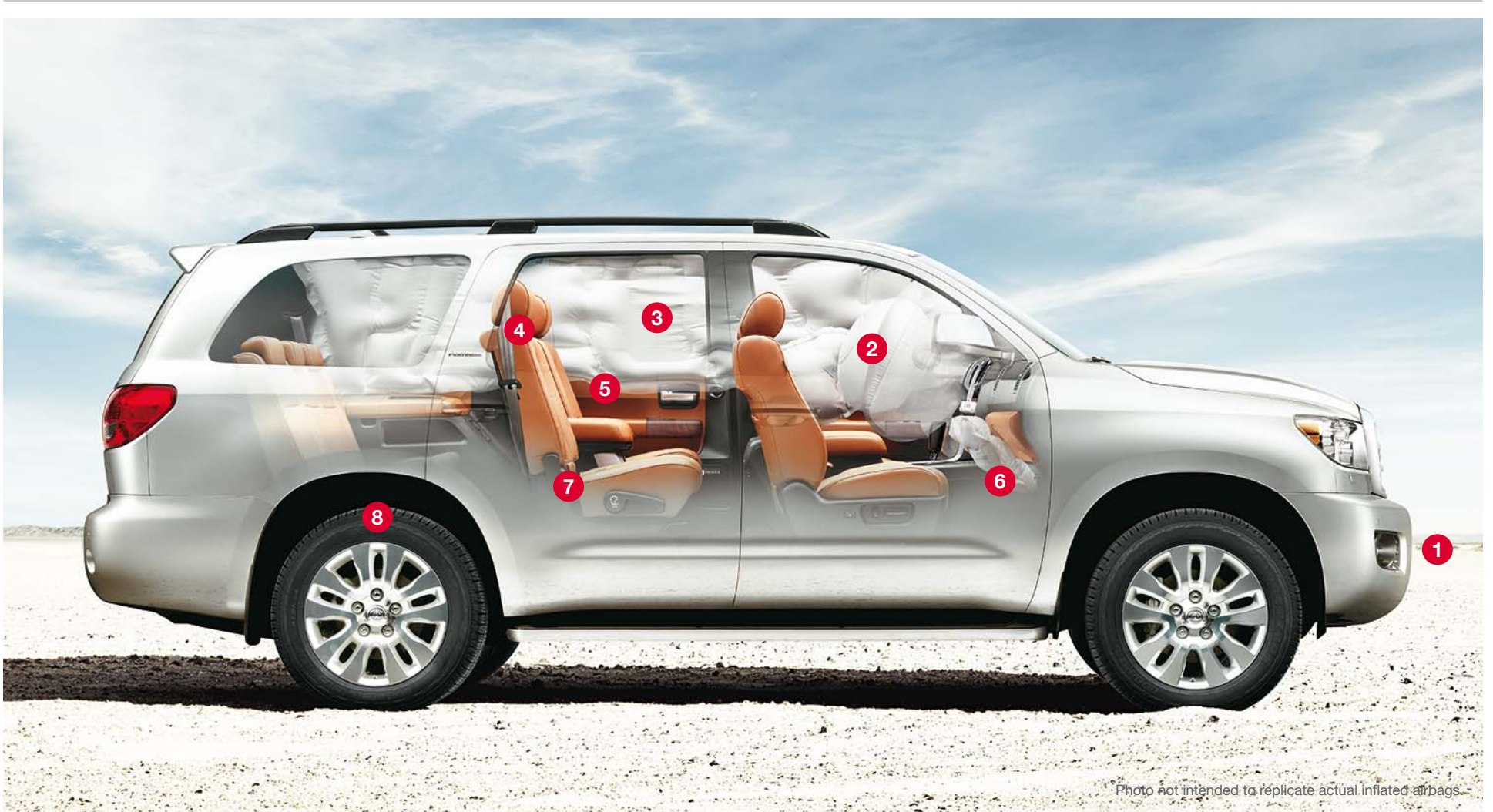
Photo not intended to replicate actual inflated airbags.

Advanced safety technologies are something you'll find throughout Sequoia. Clearly Toyota doesn't believe in simply relying on the vehicle's size to help ensure your safety. Instead, our engineers have equipped Sequoia with an array of both active and passive safety measures. Active safety features, such as Vehicle Stability Control (VSC), 1 help you avoid trouble. Passive safety features come to your aid in the event trouble proves unavoidable. Both help you breathe easier.