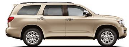
SANDY BEACH METALLIC Red Rock 1 or Sand Beige interior