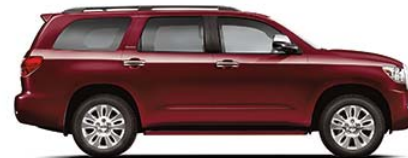
CASSIS PEARL Graphite, Red Rock 1 or Sand Beige interior