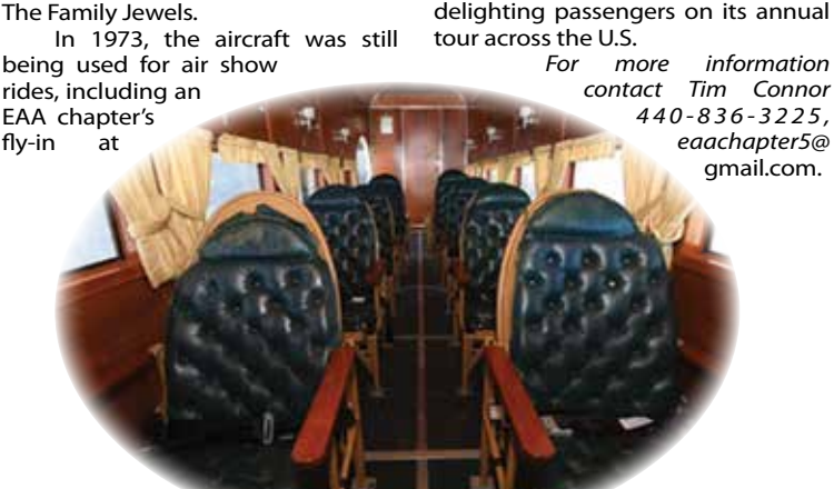
The interior view of the Ford Tri-Motor.

It was displayed in the EAA AirVenture Museum until 1991 when it returned to its former role of delighting passengers on its annual