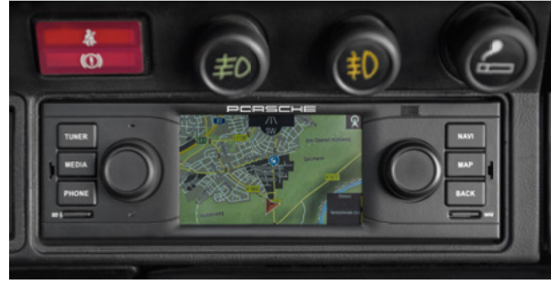
Operated via either the 3.5-inch touchscreen or the knobs and buttons