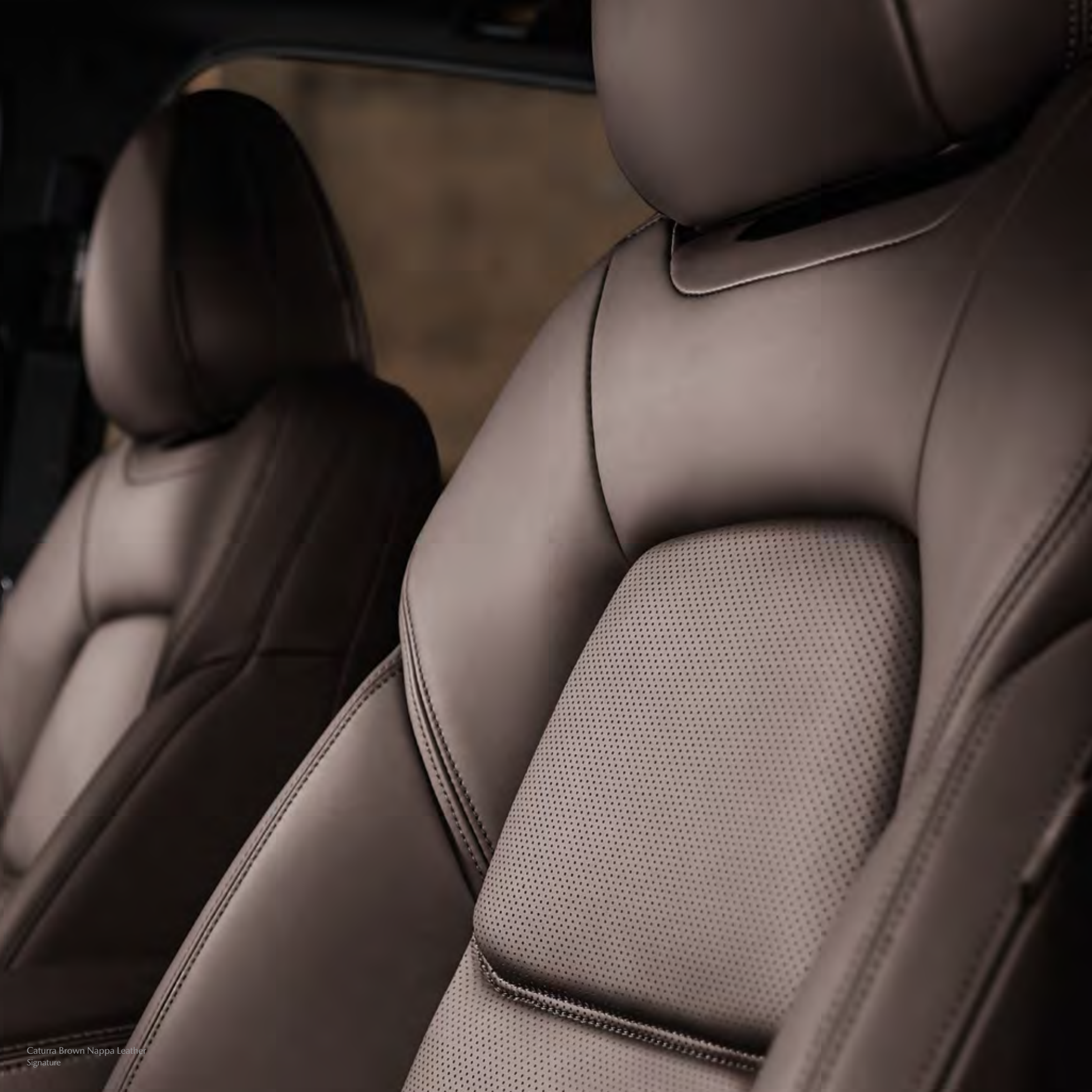
Caturra Brown Nappa Leather Signature