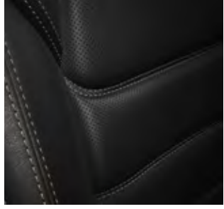
Black Leather Grand Touring and Grand Touring Reserve

Upholstery plays a unique role in automotive design. It is the one element that makes direct contact with the driver and passengers throughout the entire drive. Every inch of our carefully constructed upholstery elevates your journey in both beauty and comfort. Expert fabricators experiment with textures, stitching and seam placements to create a range of distinct and expressive designs. So you can enjoy an elegant level of refinement in every Mazda CX-5. It's one more way we consider you in every aspect of your drive.