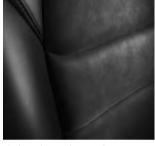
Black Leatherette/Lux Suede® inserts Touring