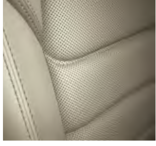
Parchment Leather Grand Touring and Grand Touring Reserve