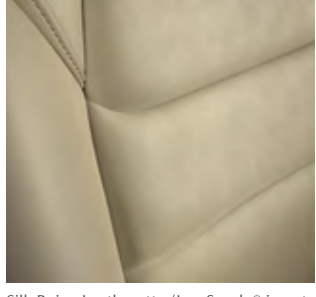
Silk Beige Leatherette/Lux Suede® inserts Touring