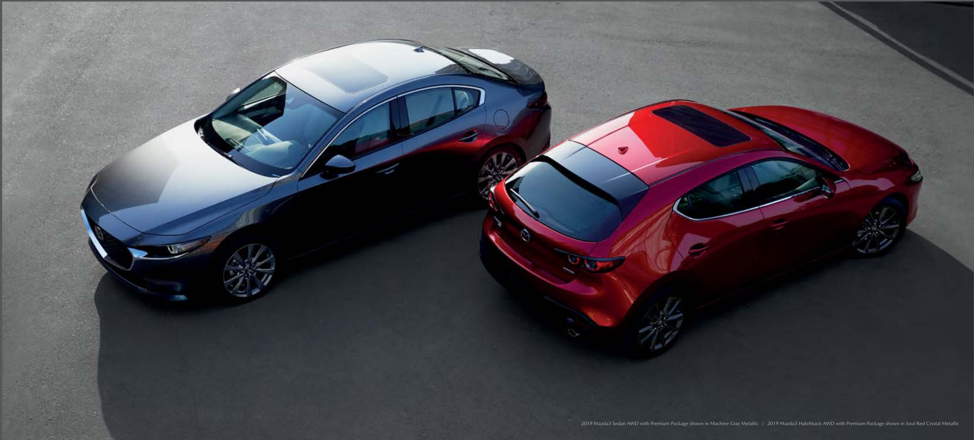
2019 Mazda3 Sedan AWD with Premium Package shown in Machine Gray Metallic | 2019 Mazda3 Hatchback AWD with Premium Package shown in Soul Red Crystal Metallic