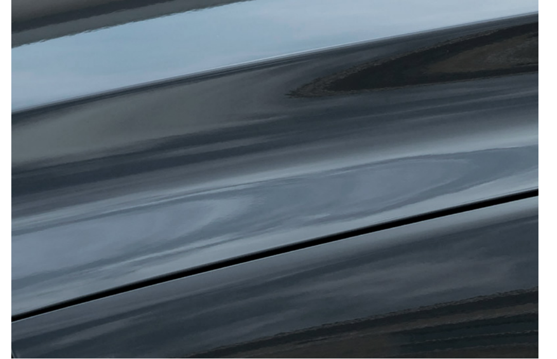
From left to right: Machine Gray Metallic, Soul Red Crystal Metallic, Polymetal Gray Metallic