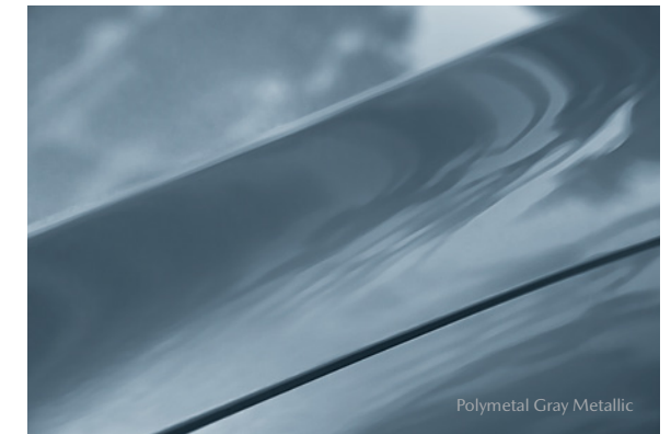
Polymetal Gray Metallic

Our daring array of lustrous finishes—including the new Polymetal Gray Metallic offered on Carbon Edition models—may be the final touch on the CX-9, but it is the first thing that will catch your eye. And it will continue to draw your gaze, time and time again.