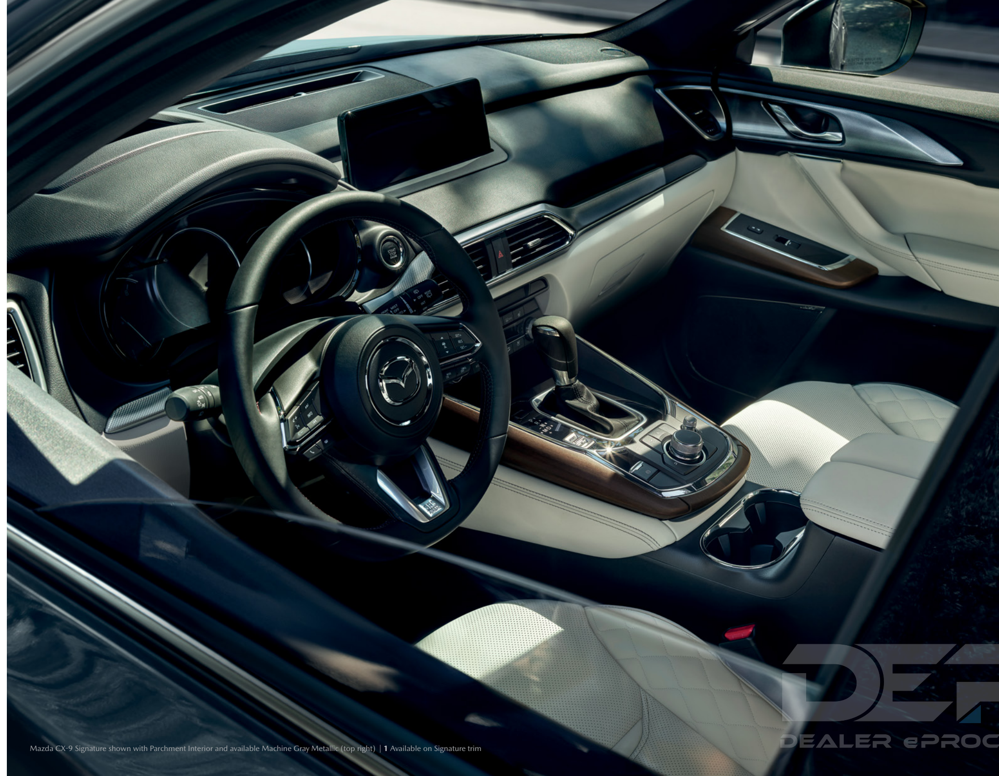
Mazda CX-9 Signature shown with Parchment Interior and available Machine Gray Metallic (top right) | 1 Available on Signature trim