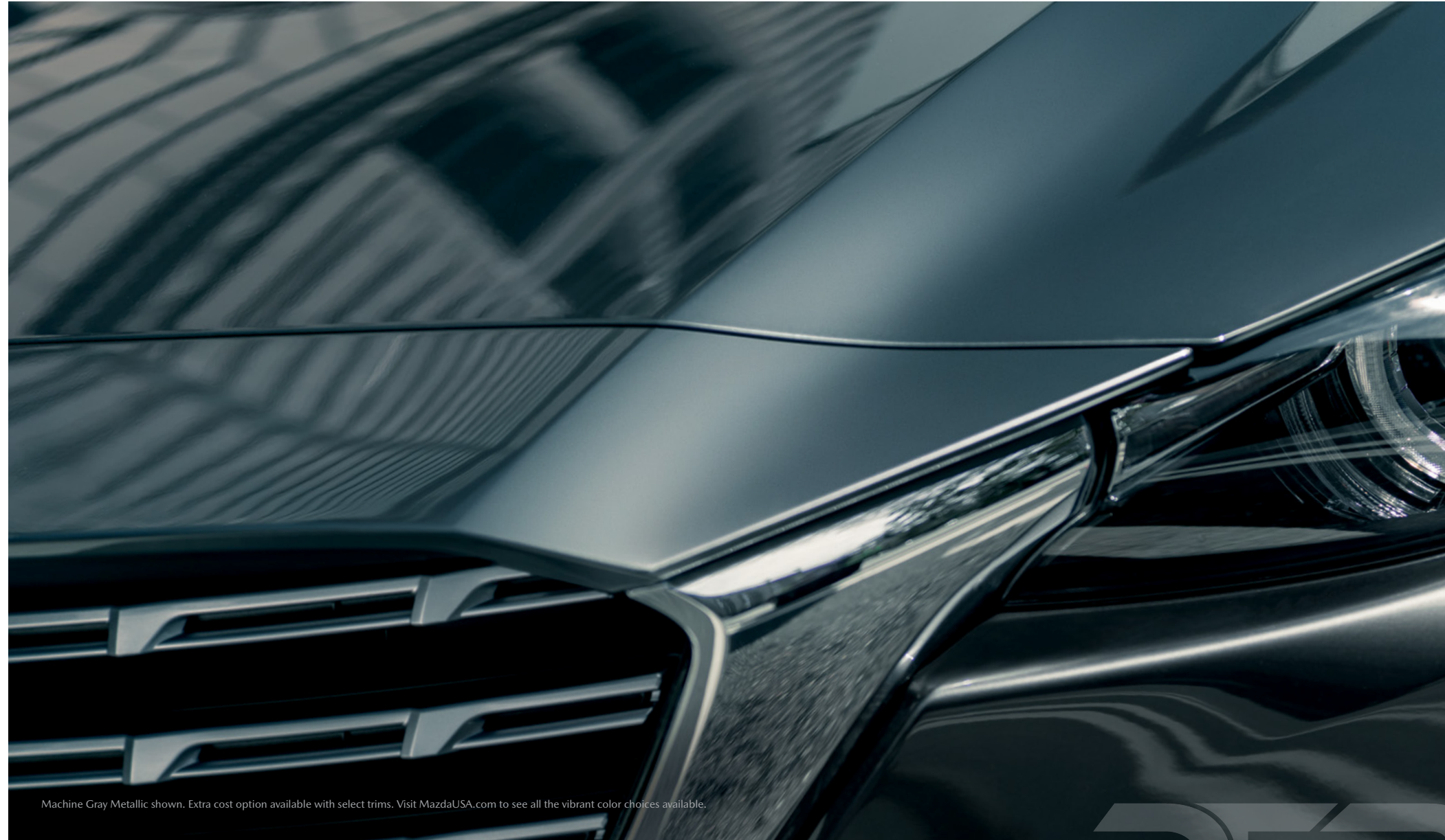
Machine Gray Metallic shown. Extra cost option available with select trims. Visit MazdaUSA.com to see all the vibrant color choices available.