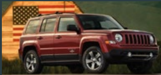
JEEP® PATRIOT FREEDOM EDITION