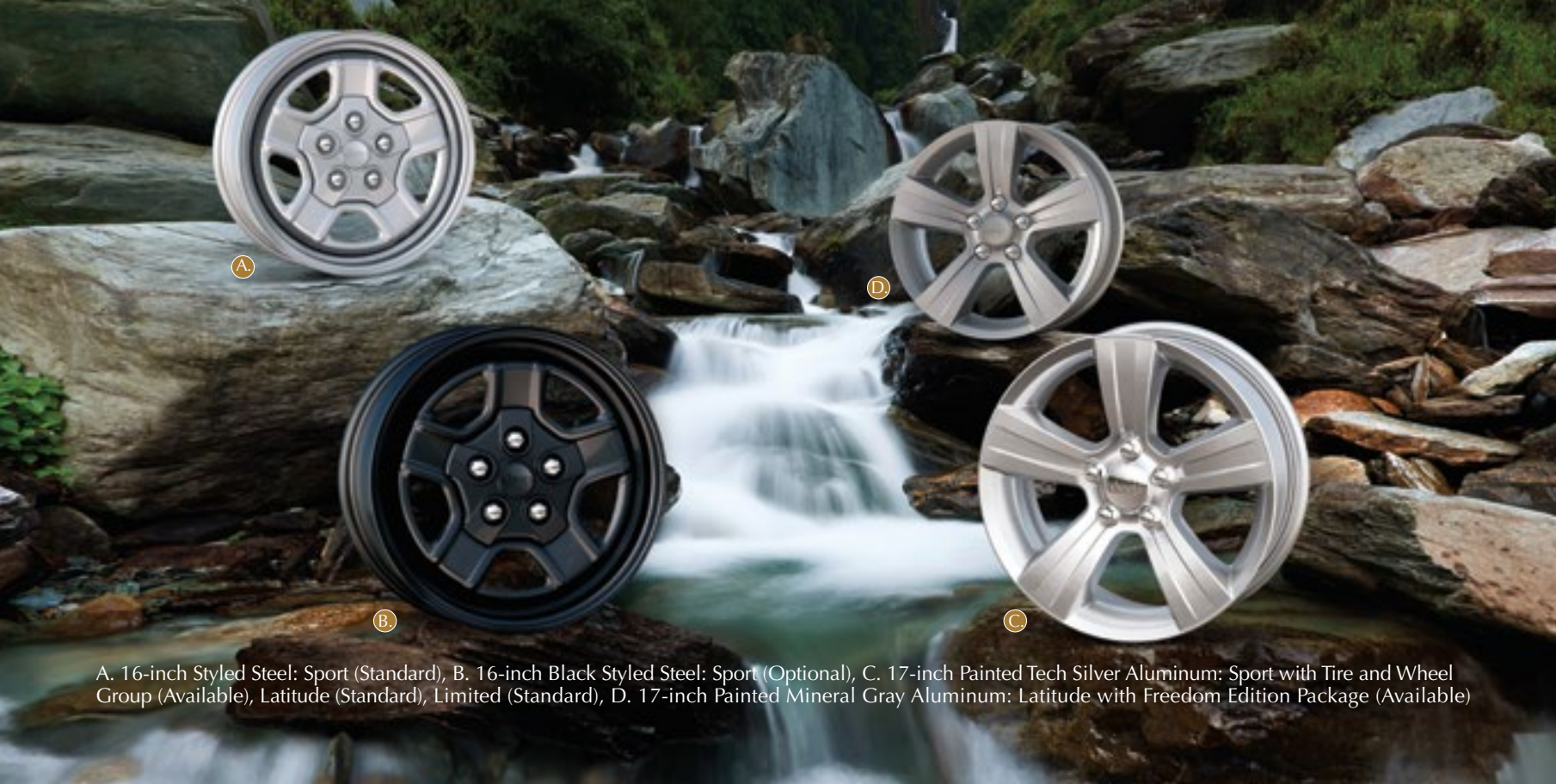
A. 16-inch Styled Steel: Sport (Standard), B. 16-inch Black Styled Steel: Sport (Optional), C. 17-inch Painted Tech Silver Aluminum: Sport with Tire and Wheel Group (Available), Latitude (Standard), Limited (Standard), D. 17-inch Painted Mineral Gray Aluminum: Latitude with Freedom Edition Package (Available)