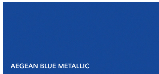
AEGEAN BLUE METALLIC