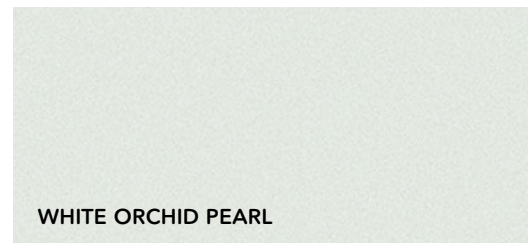
WHITE ORCHID PEARL