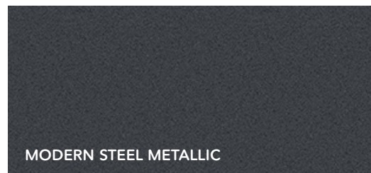
MODERN STEEL METALLIC