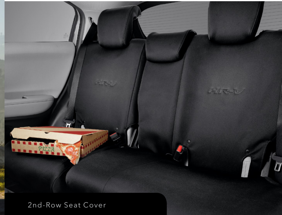
2nd-Row Seat Cover