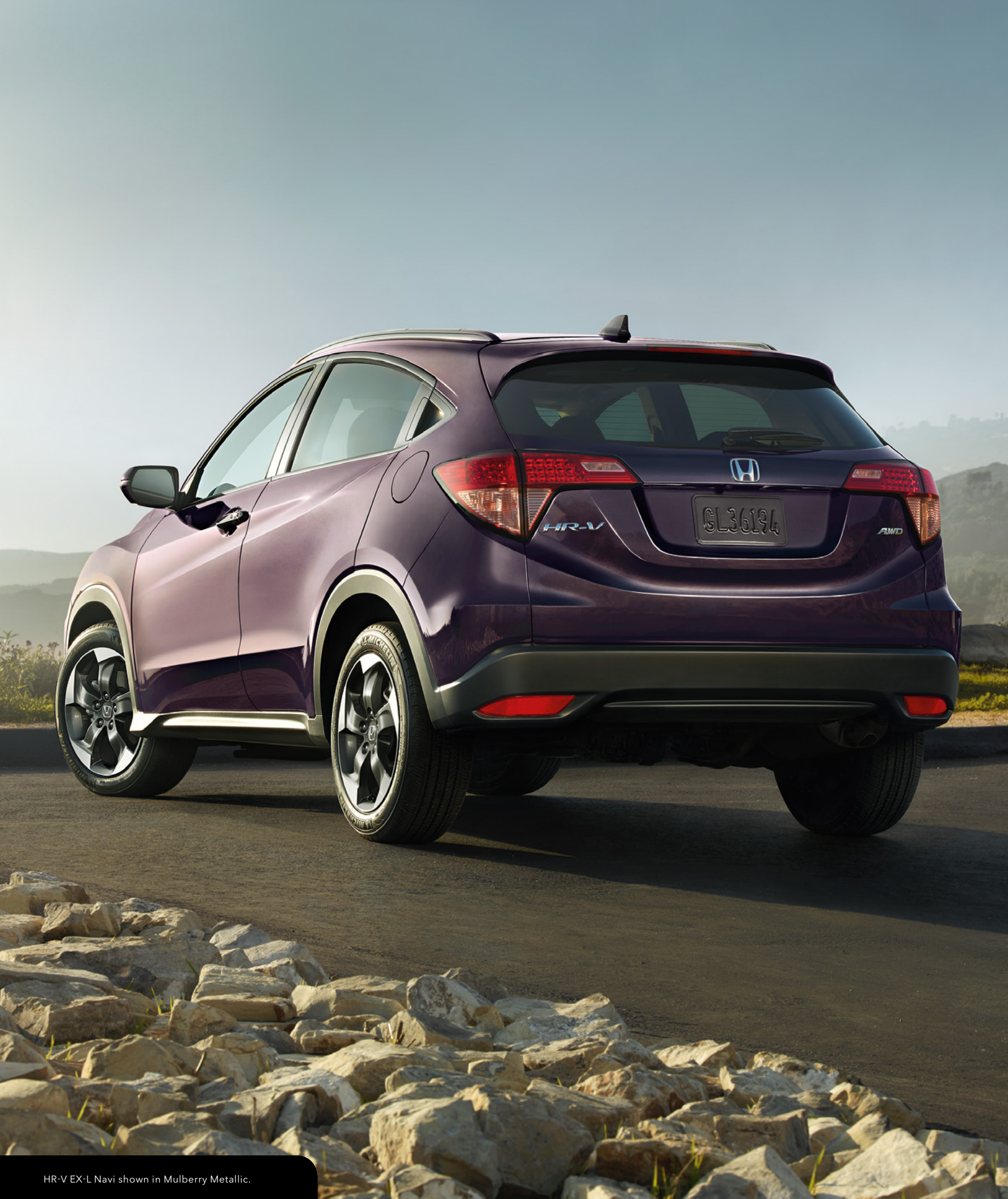
HR-V EX-L Navi shown in Mulberry Metallic.