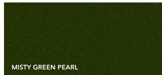
MISTY GREEN PEARL