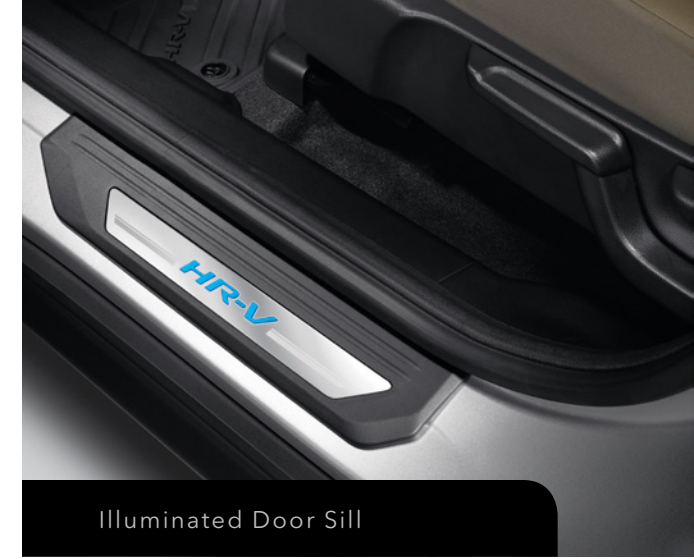
Illuminated Door Sill

HR-V EX shown in Lunar Silver Metallic with Honda Genuine Accessories.