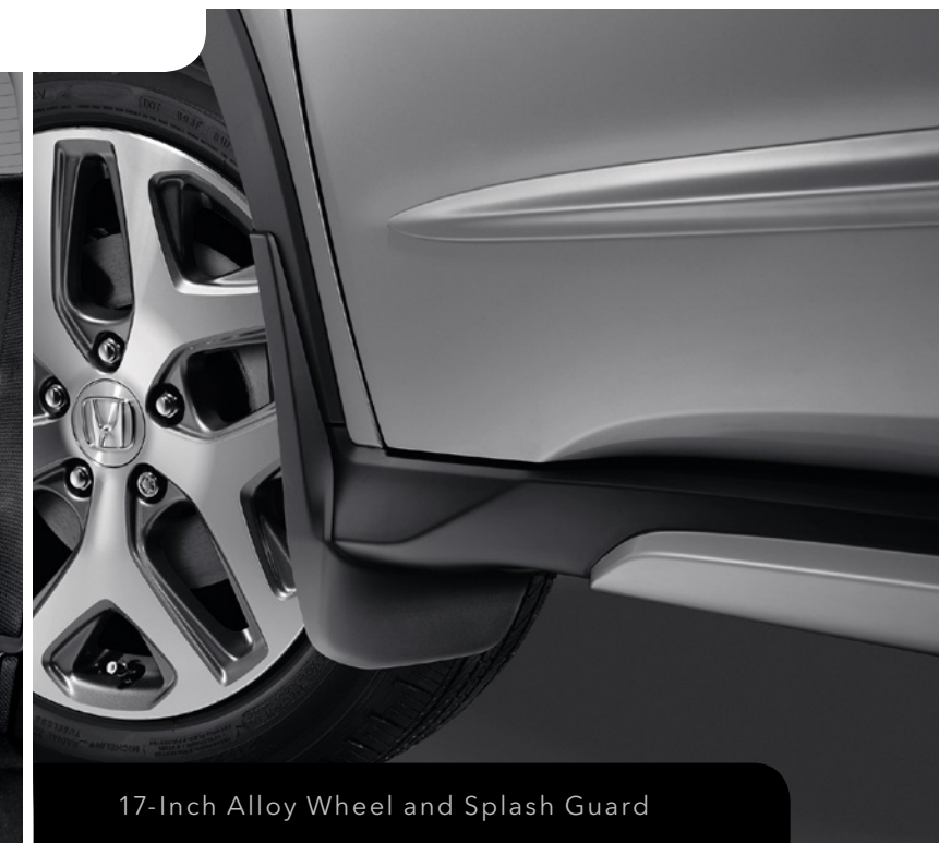
17-Inch Alloy Wheel and Splash Guard