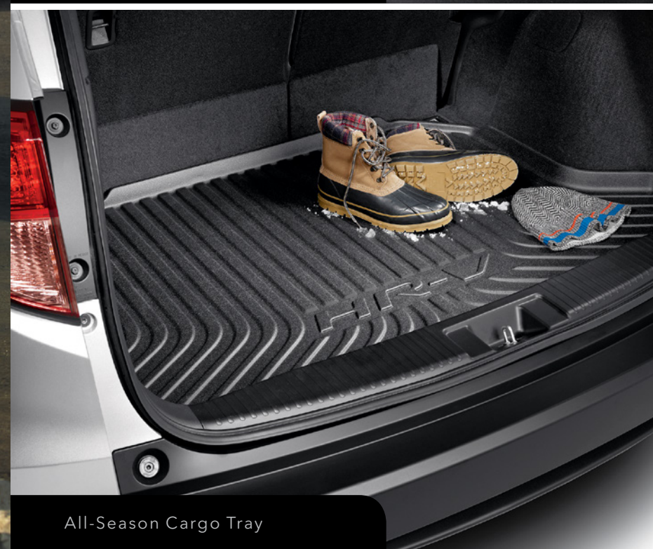
All-Season Cargo Tray