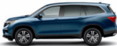
EX &amp; EX-L