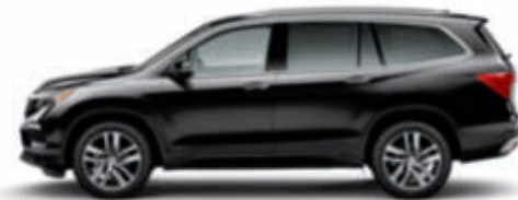
TOURING &amp; ELITE