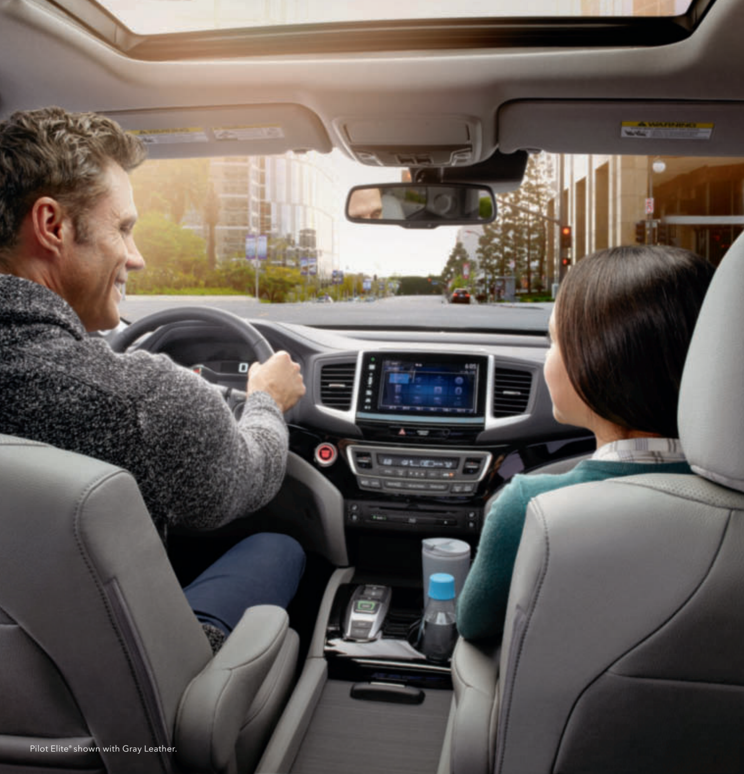
Pilot Elite® shown with Gray Leather.