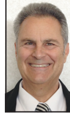
FRANK SINATRA SALES