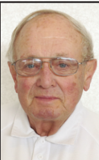
BILL LANGE USED CAR SALES