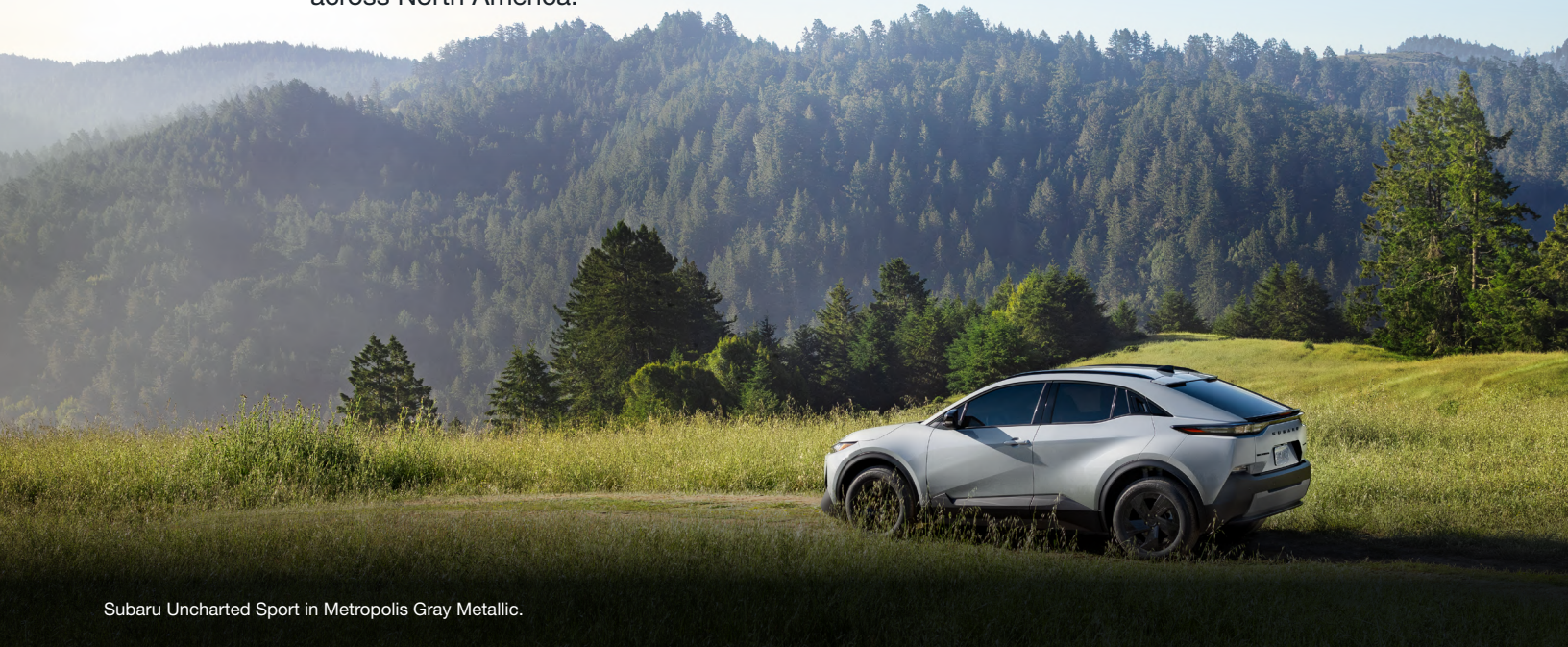
Subaru Uncharted Sport in Metropolis Gray Metallic.

Explore without limits—enjoy easy access to more than 25,000 Tesla Superchargers across North America.