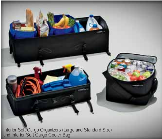
Interior Soft Cargo Organizers (Large and Standard Size) and Interior Soft Cargo Cooler Bag