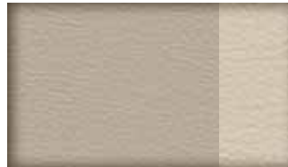
Leather - Camel with Sand inserts Standard on Limited