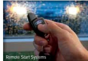
Remote Start Systems