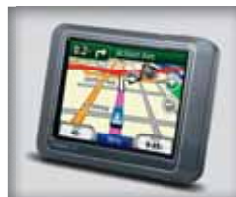
Garmin® Portable Navigation Systems 1