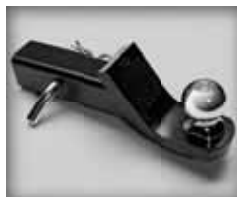
Trailer Hitch Balls/Draw Bars