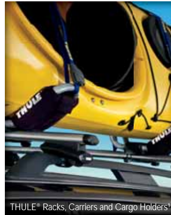
THULE® Racks, Carriers and Cargo Holders 1