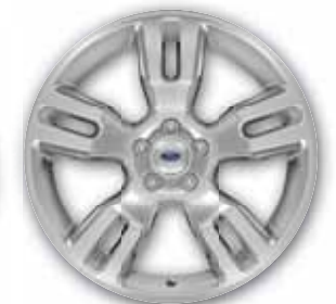
20" Polished-Aluminum Included in Adrenalin Package