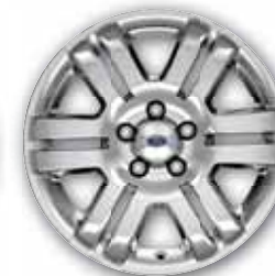
18" Chrome-Clad Aluminum Standard on Limited