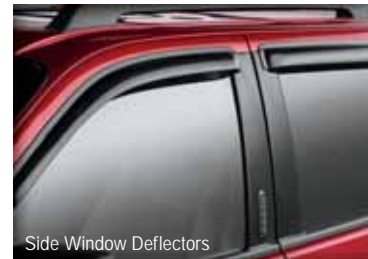
Side Window Deflectors