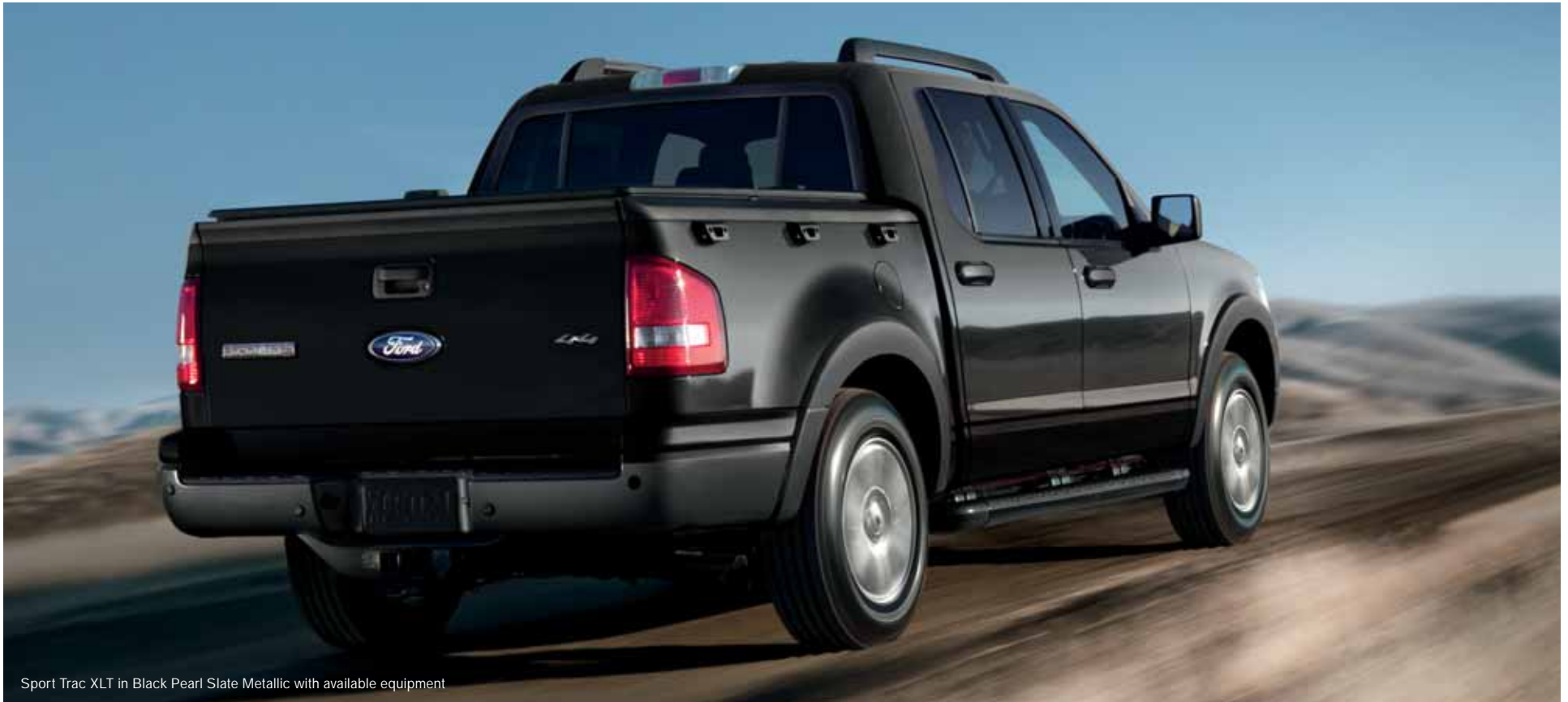
Sport Trac XLT in Black Pearl Slate Metallic with available equipment

POWER TO THE PAVEMENT (OR DIRT OR ROCK OR SNOW)