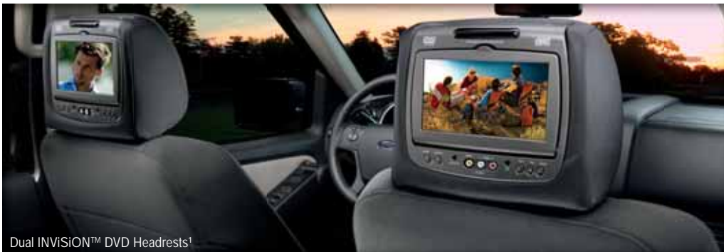
Dual INVISION™ DVD Headrests 1