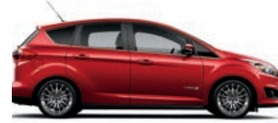
Ruby Red Metallic Tinted Clearcoat