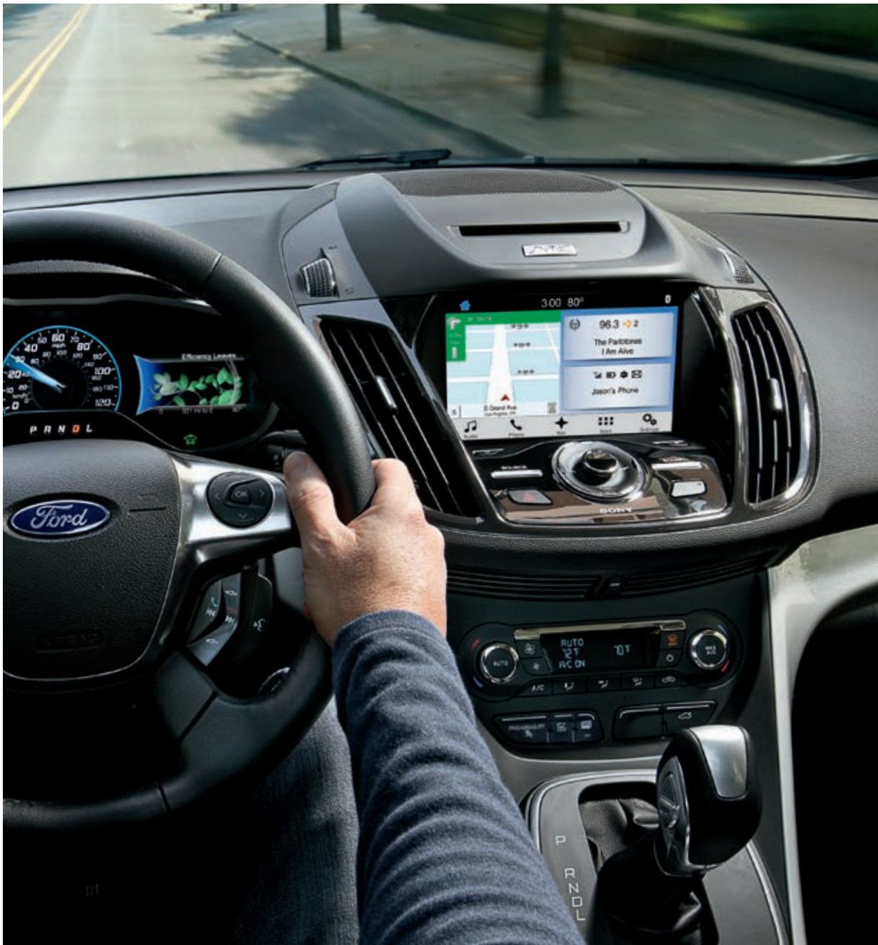
C-MAX Hybrid SEL. Charcoal Black leather trim. SYNC 3. Available equipment.