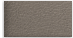
3 Medium Light Stone Leather