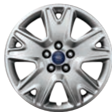
17" Steel with Sparkle Silver-Painted Wheel Covers Standard: S