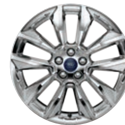
19" Chrome-Like Alloy Finish Included: Chrome Package on SE