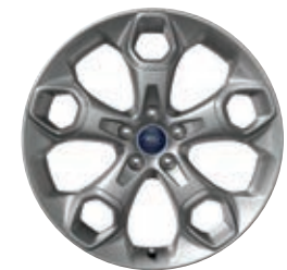
19" Premium Luster Nickel-Painted Aluminum Optional