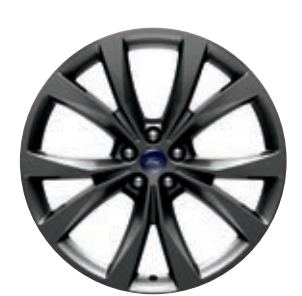
21" Premium Tarnished Dark-Painted Aluminum Available