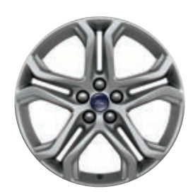
19" Luster Nickel-Painted Aluminum Standard