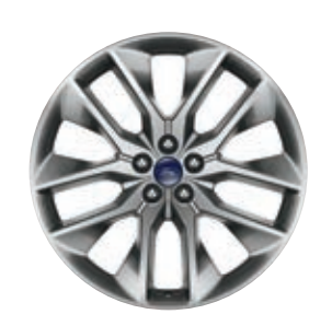
20" Polished Aluminum with Dark Stainless-Painted Pockets Available