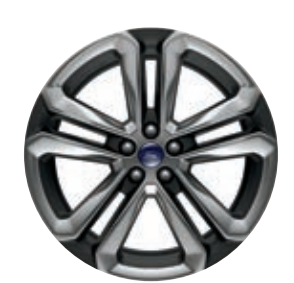
20" Polished Aluminum with Low-Gloss Magnetic-Painted Pockets Standard

Trapezoidal fascia-integrated dual bright exhaust outlets.