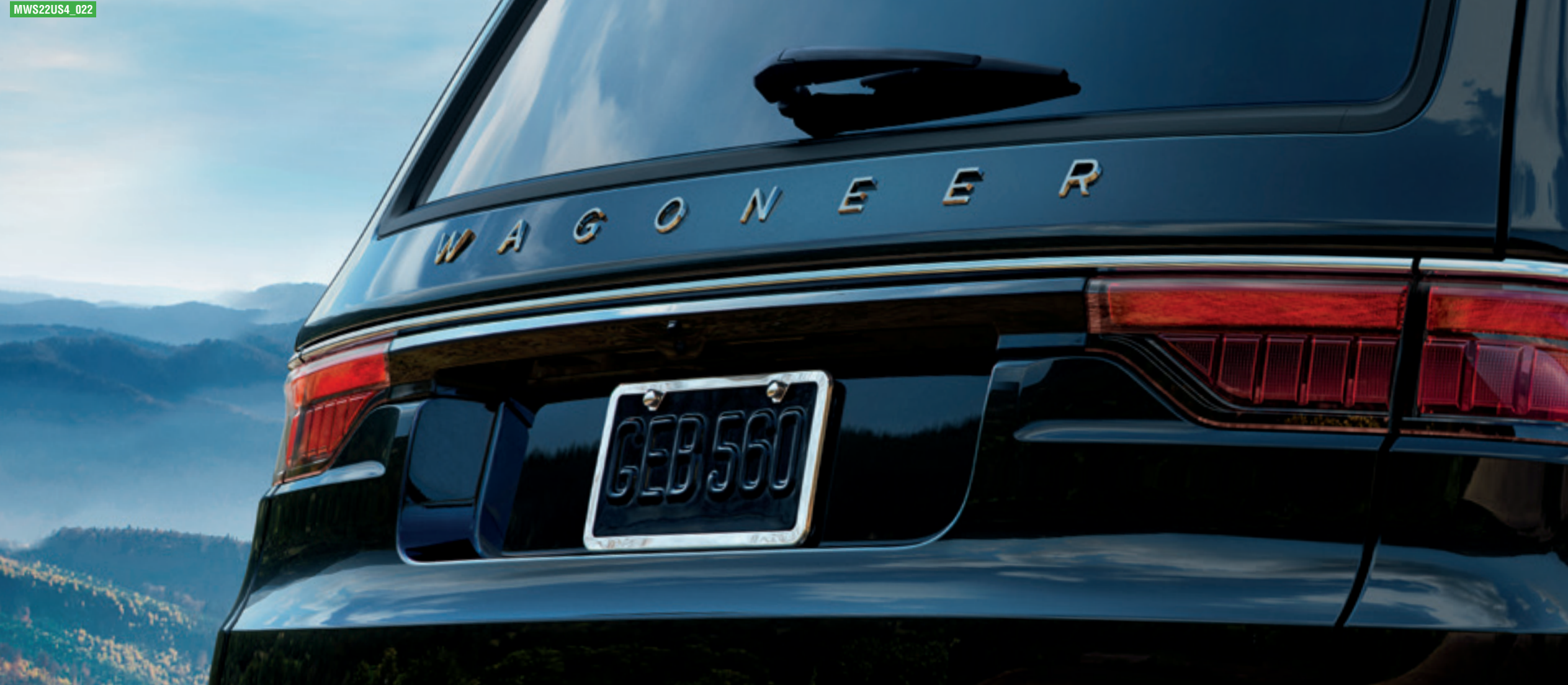
LICENSE PLATE FRAMES — Stainless steel in polished or black finish. [ 82213249AB - Polished ] [ 82213250AB - Black ]