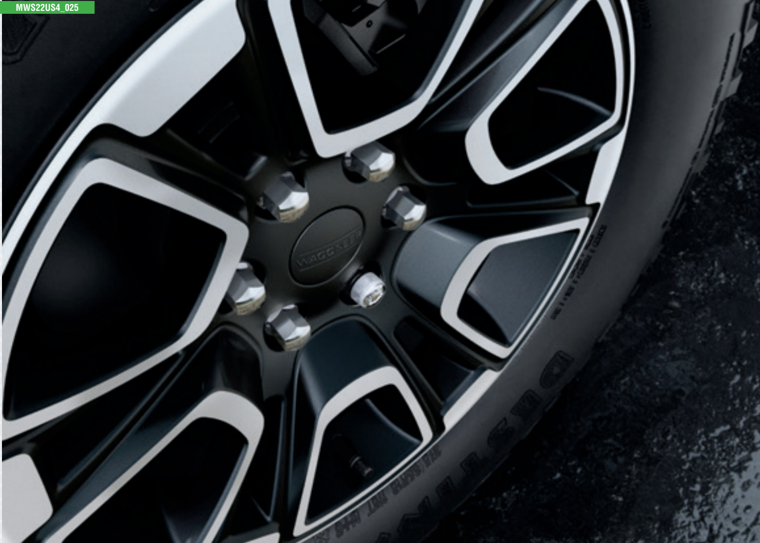
WHEEL LOCK KIT — Includes four chrome-plated lug bolts and a special-fitting key. [ 82212564 ]