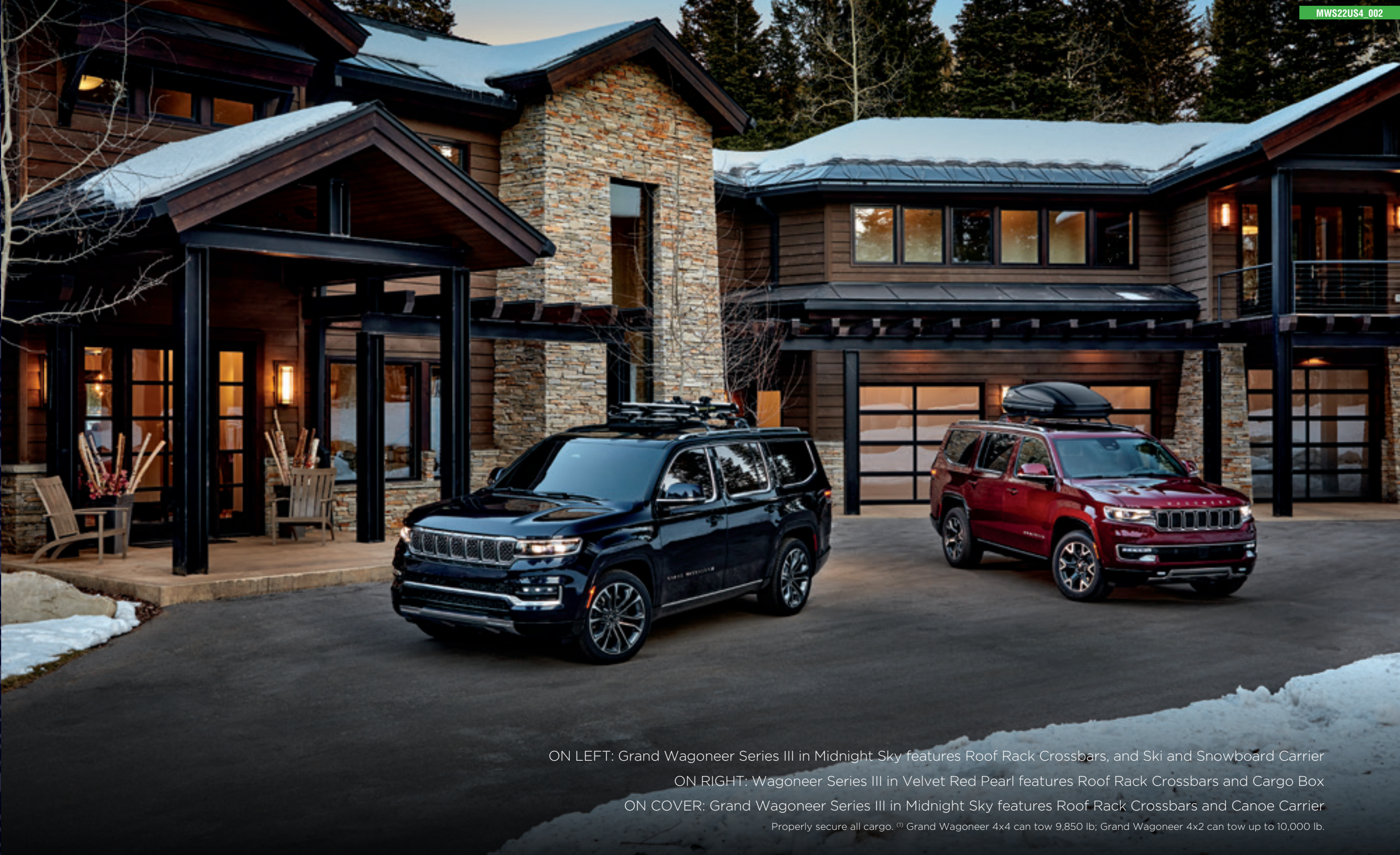
ON LEFT: Grand Wagoneer Series III in Midnight Sky features Roof Rack Crossbars, and Ski and Snowboard Carrier

WAGONEER MADE ITS PUBLIC DEBUT IN 1963 TO MUCH FANFARE, LADEN WITH MANY 4WD “FIRSTS,” SUCH AS AUTOMATIC TRANSMISSION, INDEPENDENT FRONT SUSPENSION, A STYLISH INSTRUMENT PANEL AND A PLUSH, CARPETED INTERIOR WITH PLENTY OF ROOM FOR SIX ADULTS. TODAY’S GRAND WAGONEER AND WAGONEER ELEVATE THE CRAFTSMANSHIP OF AMERICAN ARTISTRY ONCE AGAIN. OFFERING THREE ROWS OF REFINED, LEATHER-TRIMMED SEATING, INNOVATIVE TECHNOLOGIES AND SAFETY AND SECURITY FEATURES, DRIVERS AND PASSENGERS ARE INVITED TO ENJOY A DISTINCTIVE TRAVEL EXPERIENCE. WITH A CONFIGURABLE INTERIOR, THERE’S PLENTY OF ROOM TO ACCOMMODATE CARGO, LEGENDARY CAPABILITY CONFIDENTLY USHERS YOU THROUGH CHALLENGING ROAD CONDITIONS AND THE POWERTRAIN IS STRONG ENOUGH FOR WAGONEER TO TOW UP TO 10,000 LB WHEN PROPERLY EQUIPPED. 1) PREMIUM ACCESSORIES AND ENHANCEMENTS OFFERED BY MOPAR® TAKE GRAND WAGONEER AND WAGONEER TO EXCEPTIONAL LEVELS OF STYLE AND LEGENDARY CAPABILITY, ALLOWING FOR THE CUSTOMIZATION OF A VEHICLE THAT WILL RAISE THE PROFILE OF SUV COMFORT AND GRANDEUR TO IMPRESSIVE HEIGHTS.