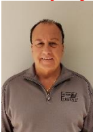
Dominick Nittolo Truck Sales