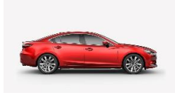
2019 Mazda 3