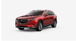
2019 Mazda CX-9