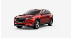
2019 Mazda CX-9