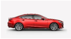
2019 Mazda 3