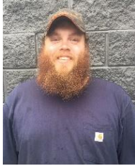
James Reid Truck Service

CHECK OUT OUR LATEST COMMERCIAL Click here to view.