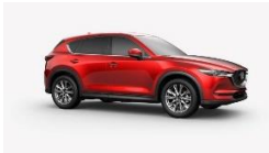
2019 Mazda CX-5