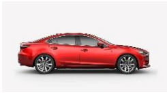
2019 Mazda 6