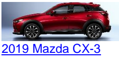
2019 Mazda CX-3