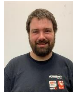
Zachary Weiner Truck Service