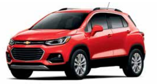
G7C - RED HOT1