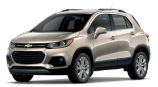
G8K - SANDY RIDGE METALLIC