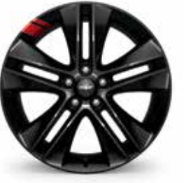
17" Black-Finish Aluminum with Red Accent Stripes (Available on LT with Redline Edition)