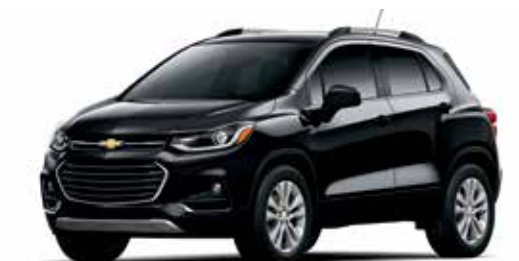
GB8 - MOSAIC BLACK METALLIC<sup>2</sup>