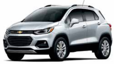
GAN - SILVER ICE METALLIC<sup>3</sup>