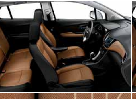
Brandy Deluxe Cloth/Leatherette with Jet Black Accents<sup>8,9</sup> Brandy Leatherette with Jet Black Accents<sup>7,9</sup>