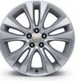
18" Aluminum (Standard on Premier)