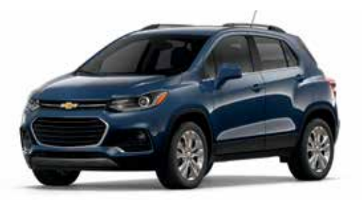
G35 – STORM BLUE METALLIC