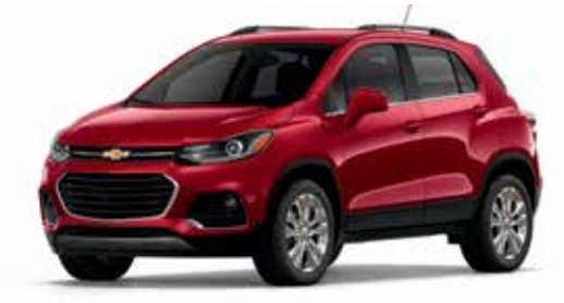
GPJ - CAJUN RED TINTCOAT<sup>1,2</sup>