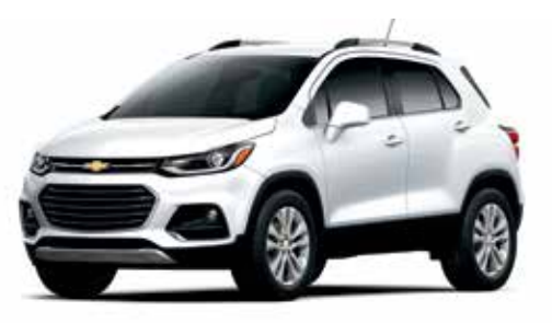
GAZ - SUMMIT WHITE