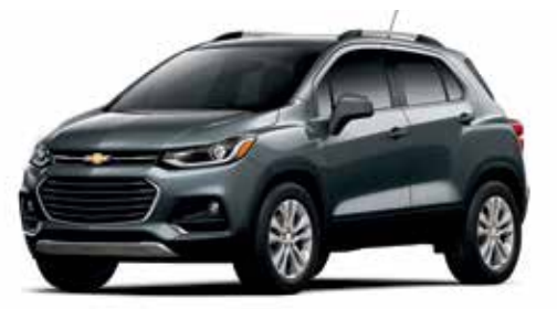
G7Q - NIGHTFALL GREY METALLIC<sup>1, 2</sup>