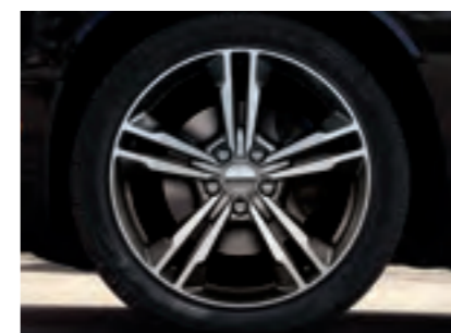
19-INCH POLISHED ALUMINUM WITH BLACK PAINTED POCKETS Standard on SXT, SXT Plus and R/T with the All-Wheel-Drive Sport Appearance Group (WGZ)