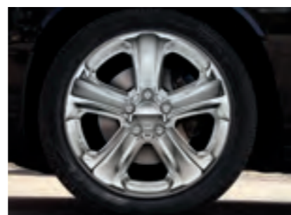
18-INCH CHROME-CLAD ALUMINUM Available on SE, SXT and SXT Plus (RWD model) (WPL)