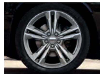
19-INCH POLISHED ALUMINUM Standard on SXT, SXT Plus and R/T (AWD model) (WGC)