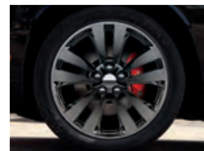
20-INCH CHROME-CLAD ALUMINUM SRT DESIGN WITH BLACK VAPOUR CHROME FINISH Available on SRT (WSJ)