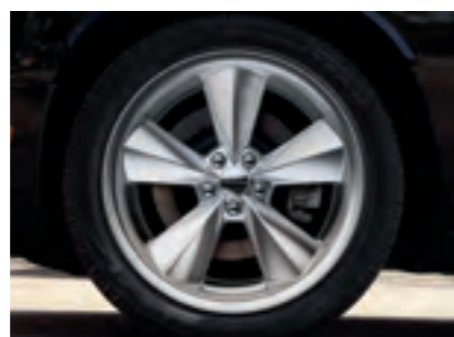
20-INCH CLASSIC POLISHED ALUMINUM Available on SXT, SXT Plus (RWD model) and R/T Road & Track (WHD)