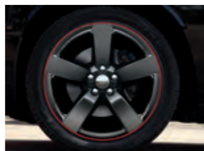
20-INCH BLACK CHROME ALUMINUM WITH RED LIP/BACKBONE Available on SXT, SXT Plus (RWD model) with Rallye Redline Appearance Package (WRL) ‡