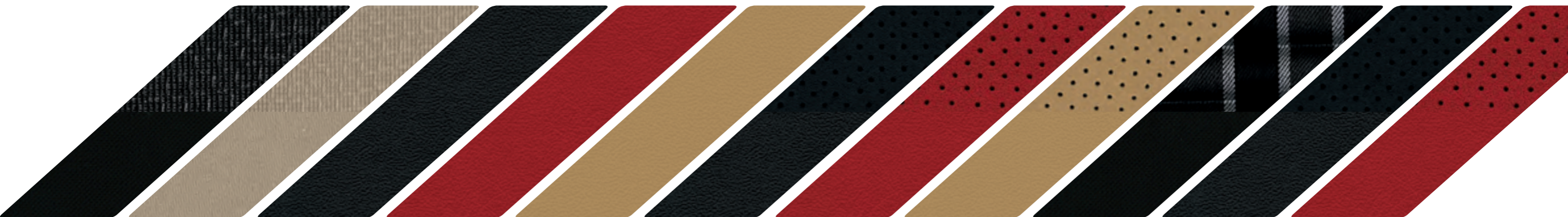
CLOTH – BLACK SE and SXT (Standard)