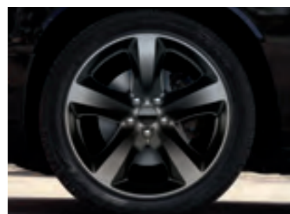
20-INCH GLOSS BLACK ALUMINUM Available on SXT, SXT Plus and R/T (RWD model) with the Blacktop Package (WRG)