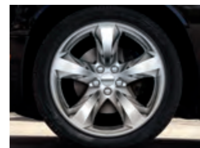
20-INCH CHROME-CLAD ALUMINUM Standard on R/T Road & Track; Available on SE, SXT, SXT Plus and R/T (RWD model) (WPG)