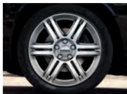
18-INCH ALUMINUM Standard on SXT, SXT Plus and R/T (RWD model) (WPB)