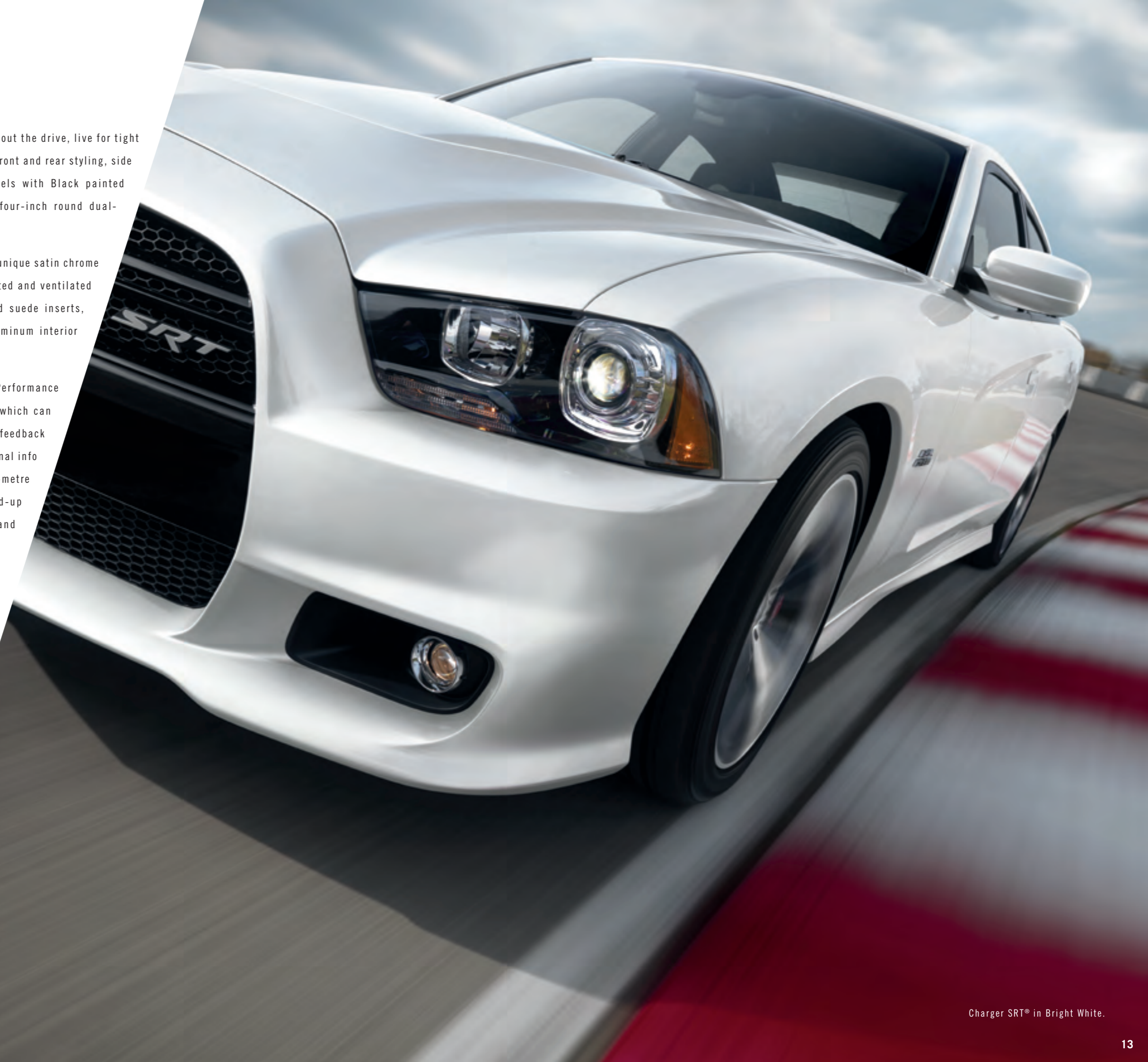
Charger SRT® in Bright White.

The three-mode Adaptive Damping Suspension featuring Sport, Track and Auto modes uses a wide range of on-road and driver inputs to automatically tune the suspension for the specific condition. The four-wheel disc antilock brakes are outfitted with vented rotors and four-piston Brembo® calipers for even clamping. Air ducts integrated into the front fascia help reduce brake temperatures.