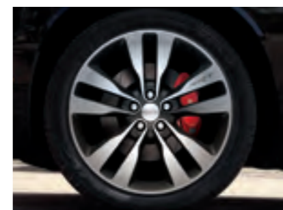
20-INCH FORGED ALUMINUM SRT DESIGN WITH BLACK PAINTED POCKETS Standard on SRT (WPQ)