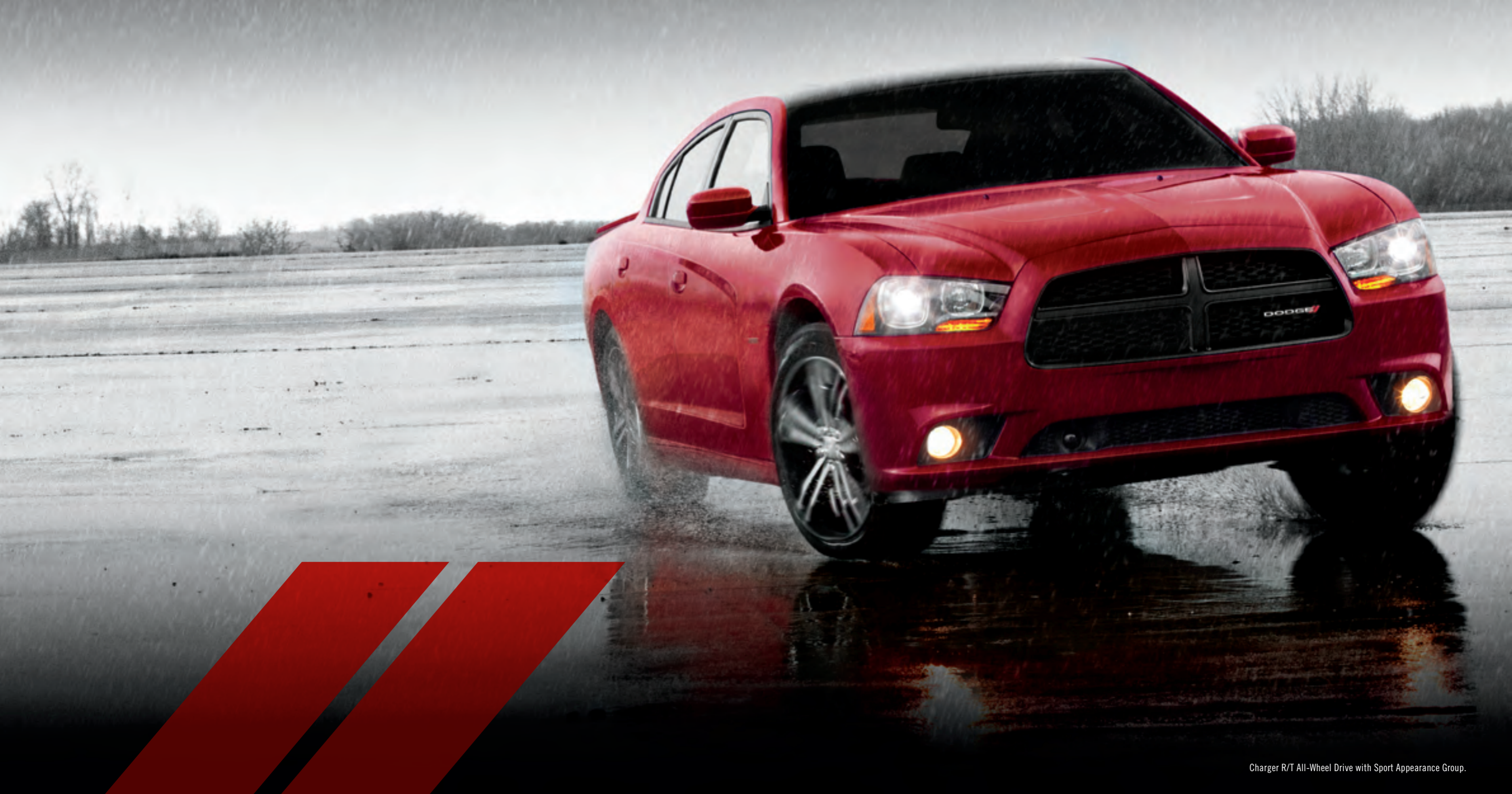
Charger R/T All-Wheel Drive with Sport Appearance Group.