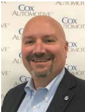
The “Shirlie Slack Way”