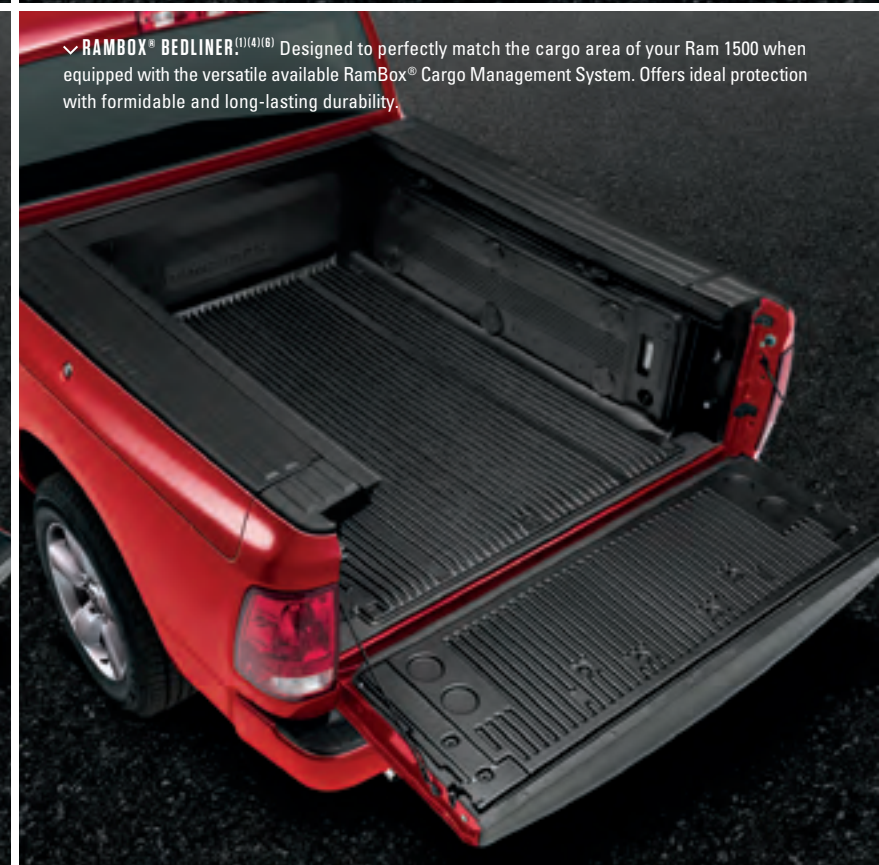
v RAMBOX® BEDLINER (1)(4)(6) Designed to perfectly match the cargo area of your Ram 1500 when equipped with the versatile available RamBox® Cargo Management System. Offers ideal protection with formidable and long-lasting durability.

Not all part numbers shown. See dealer for additional part numbers by vehicle application.