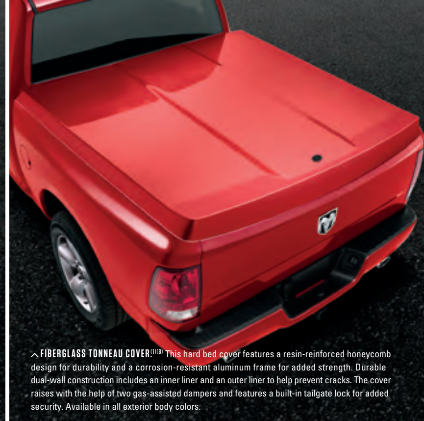
^ FIBERGLASS TONNEAU COVER (1)(3) This hard bed cover features a resin-reinforced honeycomb design for durability and a corrosion-resistant aluminum frame for added strength. Durable dual-wall construction includes an inner liner and an outer liner to help prevent cracks. The cover raises with the help of two gas-assisted dampers and features a built-in tailgate lock for added security. Available in all exterior body colors.