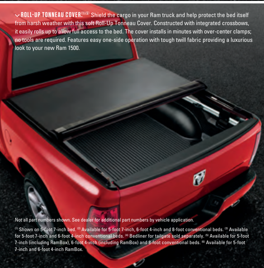
v ROLL-UP TONNEAU COVER (1)(5) Shield the cargo in your Ram truck and help protect the bed itself from harsh weather with this soft Roll-Up Tonneau Cover. Constructed with integrated crossbows, it easily rolls up to allow full access to the bed. The cover installs in minutes with over-center clamps; no tools are required. Features easy one-side operation with tough twill fabric providing a luxurious look to your new Ram 1500.