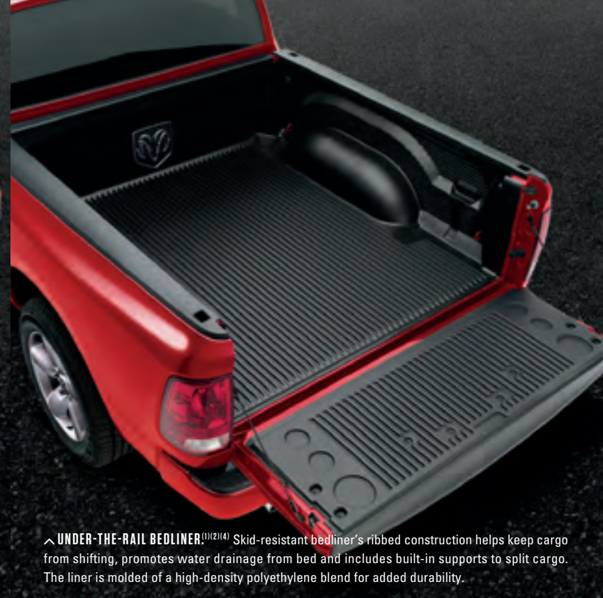
^ UNDER-THE-RAIL BEDLINER (1)(2)(4) Skid-resistant bedliner's ribbed construction helps keep cargo from shifting, promotes water drainage from bed and includes built-in supports to split cargo. The liner is molded of a high-density polyethylene blend for added durability.