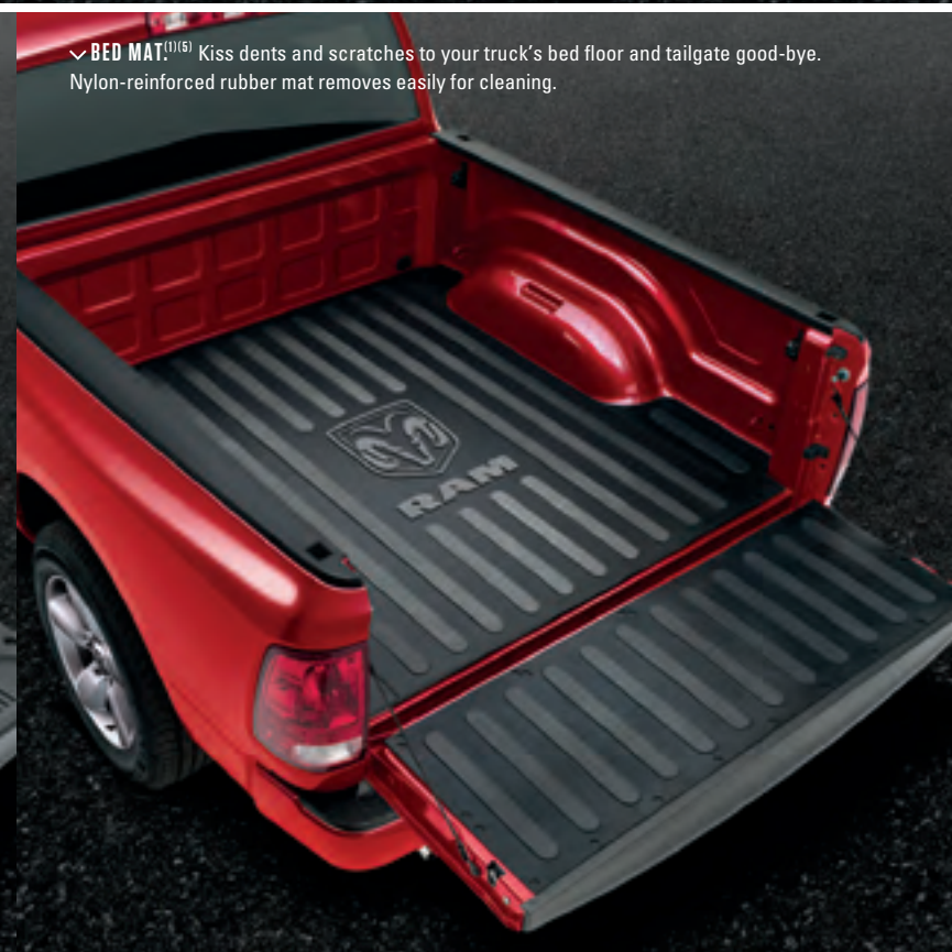
v BED MAT (1)(5) Kiss dents and scratches to your truck's bed floor and tailgate good-bye. Nylon-reinforced rubber mat removes easily for cleaning.