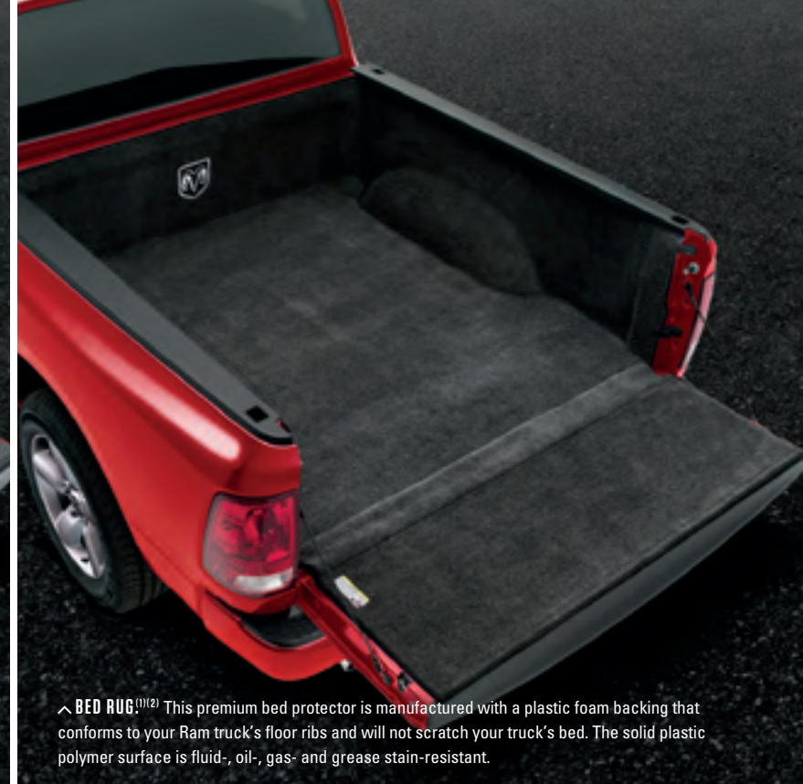
^ BED RUG (1)(2) This premium bed protector is manufactured with a plastic foam backing that conforms to your Ram truck's floor ribs and will not scratch your truck's bed. The solid plastic polymer surface is fluid-, oil-, gas- and grease stain-resistant.