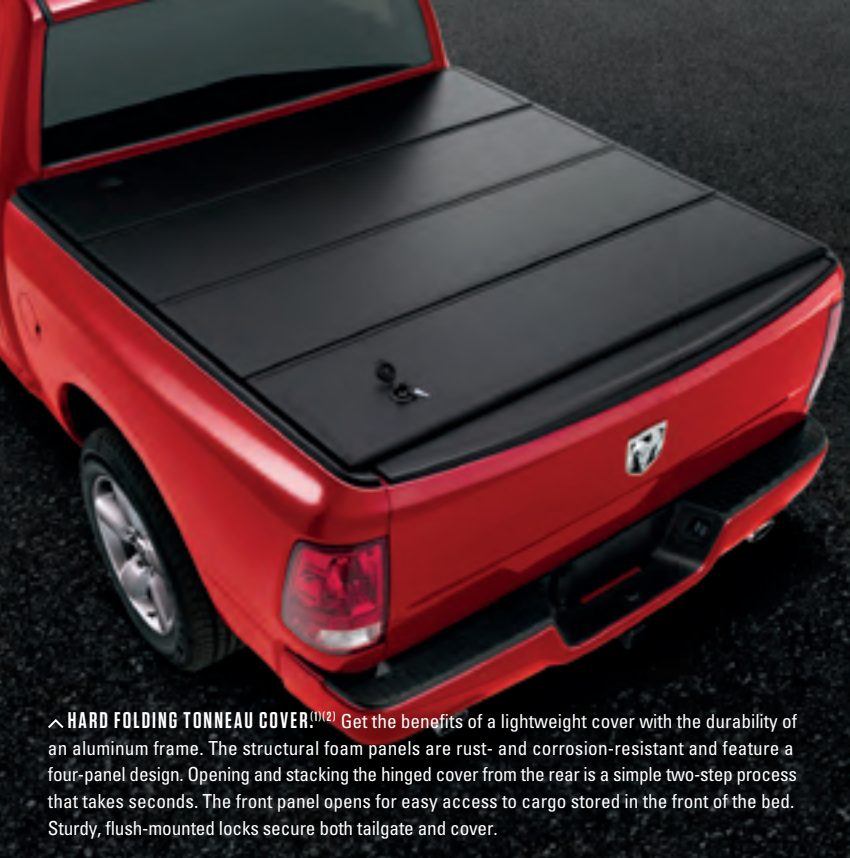
^ HARD FOLDING TONNEAU COVER (1)(2) Get the benefits of a lightweight cover with the durability of an aluminum frame. The structural foam panels are rust- and corrosion-resistant and feature a four-panel design. Opening and stacking the hinged cover from the rear is a simple two-step process that takes seconds. The front panel opens for easy access to cargo stored in the front of the bed. Sturdy, flush-mounted locks secure both tailgate and cover.