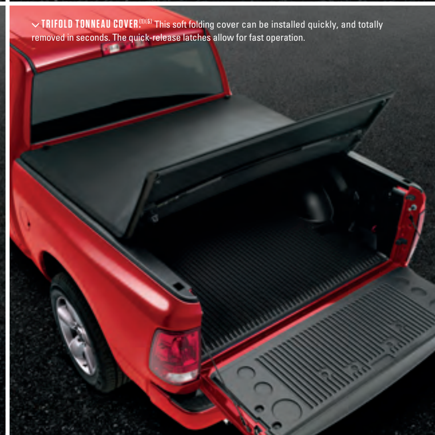
v TRIFOLD TONNEAU COVER (1)(5) This soft folding cover can be installed quickly, and totally removed in seconds. The quick-release latches allow for fast operation.