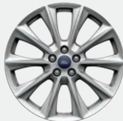
19" Polished Aluminum Standard: Platinum