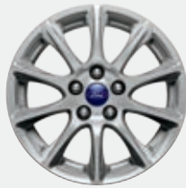
16" Painted Aluminum Standard: S