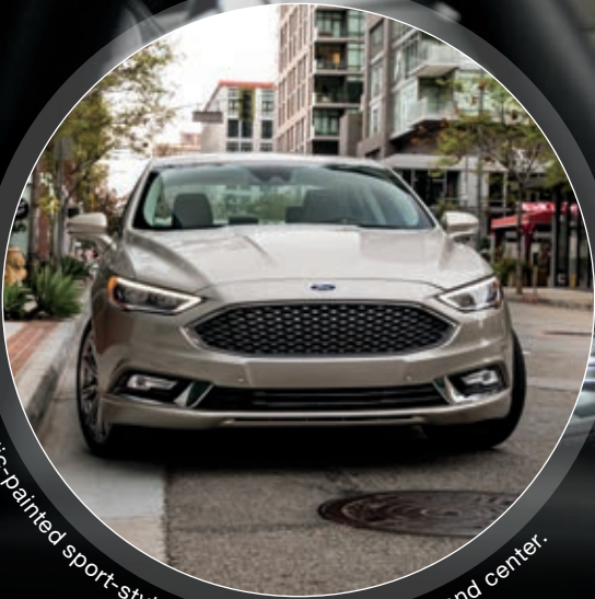
The Magnetic-painted sport-style grille puts Platinum front and center.

Every driver-assist technology Fusion offers is standard on Platinum. As is a Navigation System with SiriusXM® Traffic and Travel Link® to help guide you. Outside, Platinum distinction is marked by a Magnetic-painted sport-style grille, a power moonroof overhead, and 19" polished aluminum wheels 1 at the corners.