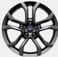
18" Dark Stainless-Painted Aluminum Included: S Appearance Package, SE Appearance Package, Hybrid SE Appearance Package