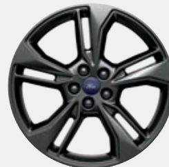
19" Premium Tarnished Dark-Painted Standard: V6 Sport