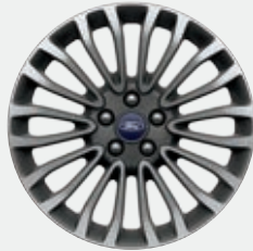
18" Machined Face Aluminum with Painted Pockets Standard: Titanium, Hybrid Titanium, Hybrid Platinum Available: SE, SE Hybrid Optional: Fusion Energi SE, Fusion Energi Titanium, Fusion Energi Platinum