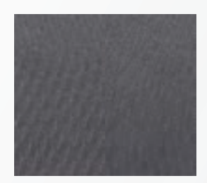
GREY CLOTH With YES Essentials® stain protectant Standard on 2.4 FWD models