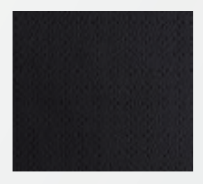
BLACK LEATHER Standard on 2.4 Luxury, 2.0T SE, and 2.0T Limited models