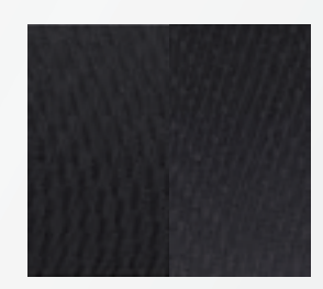
BLACK CLOTH With YES Essentials® stain protectant Standard on 2.4 Premium and 2.0T Premium models