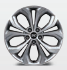
2.0T SE and 2.0T Limited 19" Rim