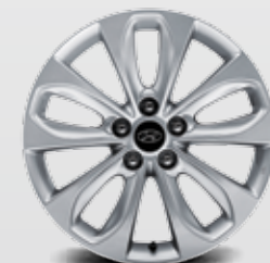
SE and 2.0T Limited Rim