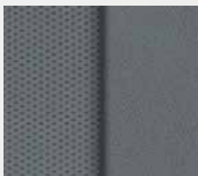
Grey Leather C