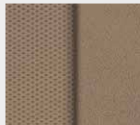
Camel Leather D