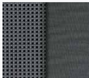
Grey Cloth A