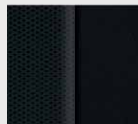
Black Leather E