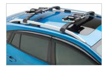
J-style carrier folds down when not in use.