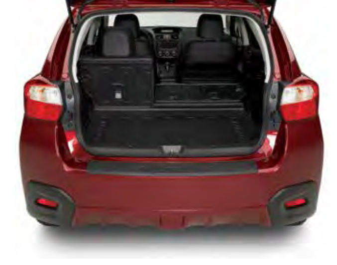
Rear Seat Back Protector Provides additional protection to the rear seat backs when lowering the seats to transport larger cargo. J501SFJ600