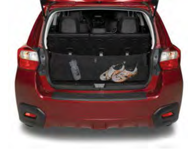
Cargo Net – Rear Neatly holds cargo upright and prevents it from sliding while the vehicle is in motion. F551SFJ100

Side Cargo Nets Holds smaller items upright inside the cargo area of the XV Crosstrek. Kit includes 2 nets. F551SFJ200