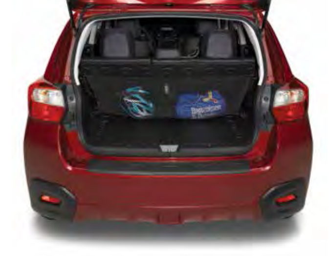
Cargo Net – Rear Seat Back Additional cargo net storage to help keep the cargo area organized. F551SFJ000