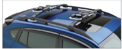
J-style carrier folds down when not in use.