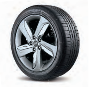
Veloster Turbo 18" Wheel

Lettering denotes available colour combinations.