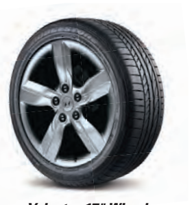
Veloster 17" Wheel