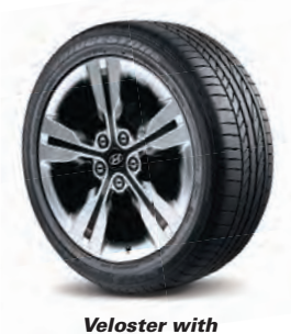
Veloster with Tech Package 18" Wheel