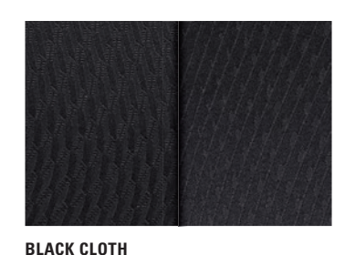
With YES Essentials® stain protectant. Standard on 2.4L Premium and 2.0T Premium models only.