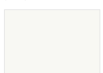
FROST WHITE PEARL