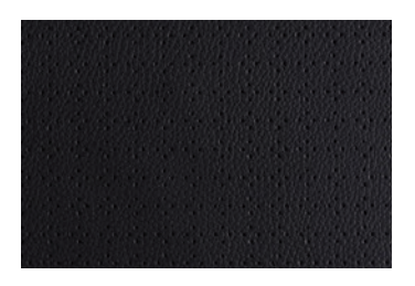
BLACK LEATHER Standard on 2.4L Luxury, 2.0T SE and 2.0T Limited models only.