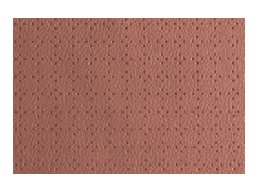
SADDLE LEATHER Available on 2.0T Limited model only (Sparkling Silver, Frost White and Twilight Black only).