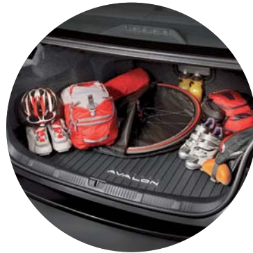
Cargo tray 2