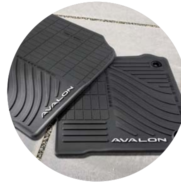
All-weather floor mats 3