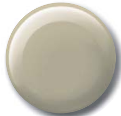
Crème Brulee Mica