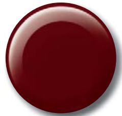
Moulin Rouge Mica