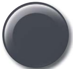
Magnetic Gray Metallic