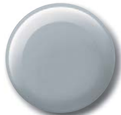
Classic Silver Metallic