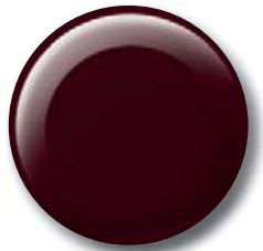
Sizzling Crimson Mica