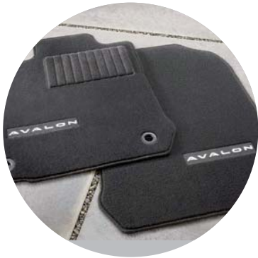
Carpet floor mats 3