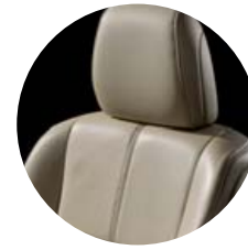
Almond leather trim