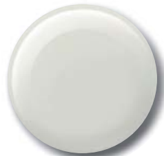
Blizzard Pearl Extra-cost color