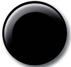
Attitude Black Metallic