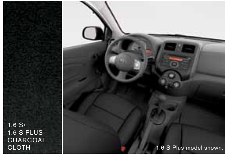
1.6 S/ 1.6 S PLUS CHARCOAL CLOTH