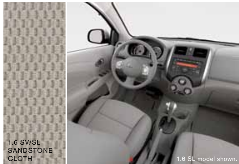
1.6 SV/SL SANDSTONE CLOTH