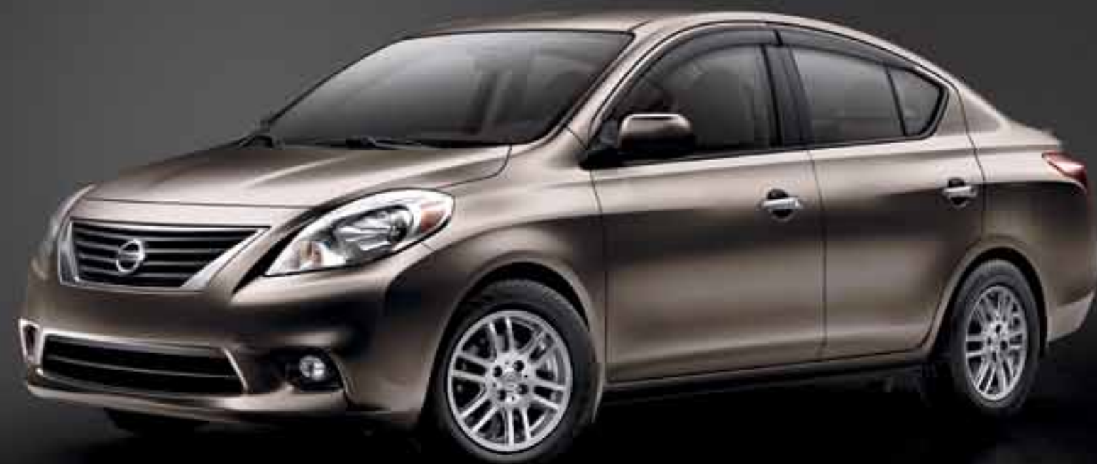
Nissan Versa 1.6 SV Sedan shown with 15" 6-spoke Aluminum-alloy Wheels, Fog Lights, Splash Guards and Side-window Deflectors.

For more information and to shop online for Genuine Nissan Accessories, go to parts.NissanUSA.com .