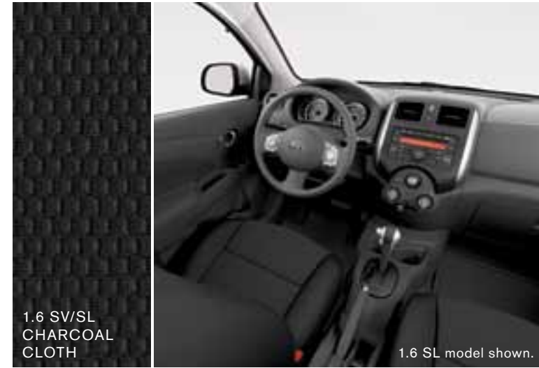
1.6 SV/SL CHARCOAL CLOTH