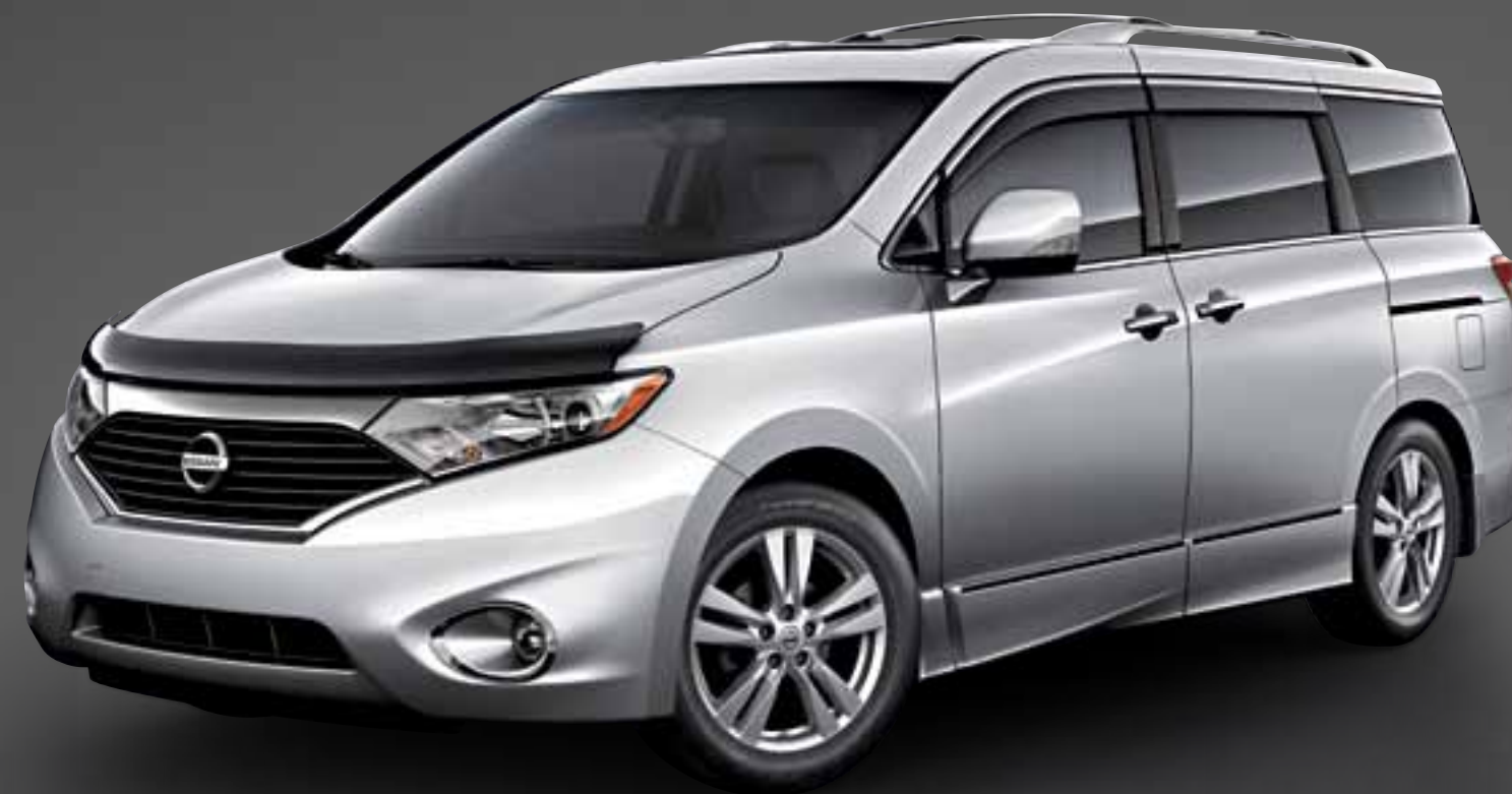
Nissan Quest SL shown in Brilliant Silver with Dual Opening Glass Moonroof Package with Hood Protector, Roof Rail Crossbars, Side-window Deflectors, Chrome Fog Light Trim and Splash Guards.

For more information on the complete line of Genuine Nissan Accessories, go to NissanUSA.com/accessories . Or shop online at the Nissan eStore.