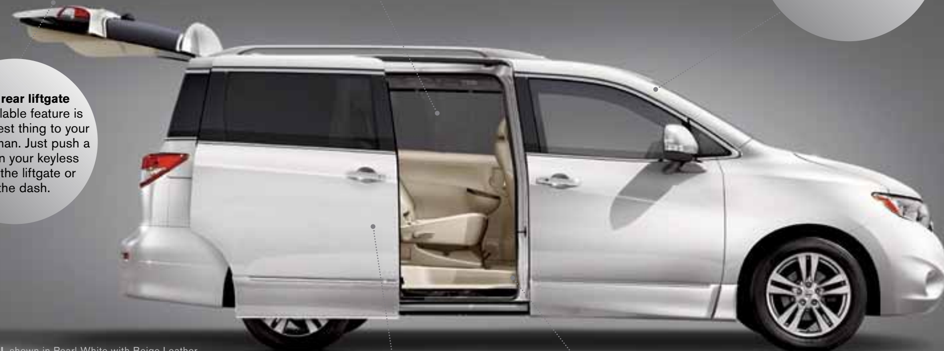
Nissan Quest SL shown in Pearl White with Beige Leather.

Power rear liftgate This available feature is the next best thing to your own doorman. Just push a button on your keyless remote, the liftgate or on the dash.