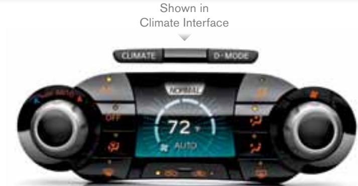
Shown in Climate Interface

Double Agent – I-CON puts you in charge of your ride style and interior comfort. In D-Mode, the system gives you the ability to rapidly adapt to changing driving conditions. With a push of the Climate button, I-CON switches displays and now becomes your control center for all things comfort.