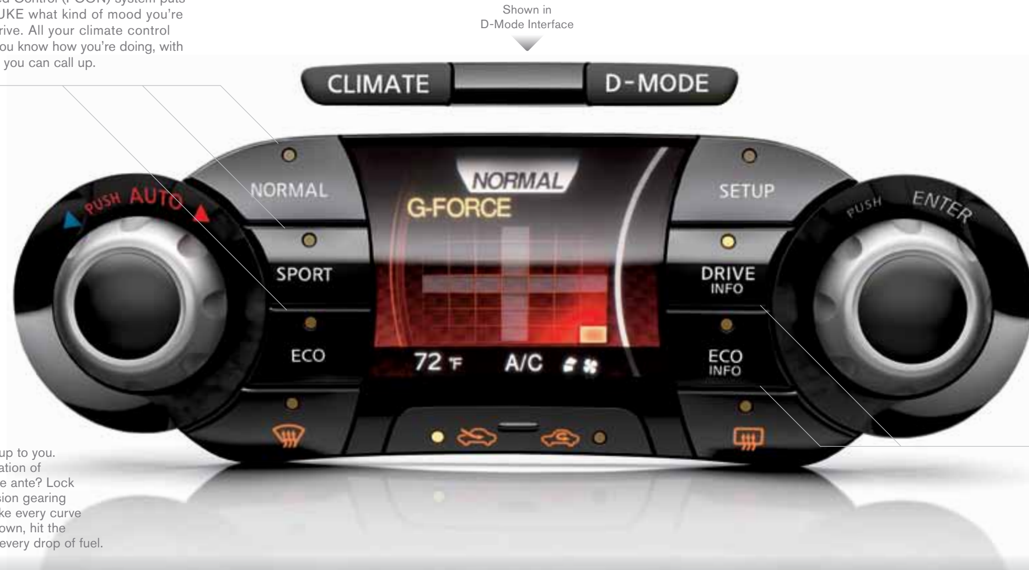
Shown in D-Mode Interface

Torque It. Boost It. Save It – In JUKE, it's up to you. Drive in Normal mode for the best combination of performance and efficiency. Want to up the ante? Lock in Sport mode and steering feel, transmission gearing and throttle response quickly adjust to make every curve count. And when it's time to slow things down, hit the Eco mode button and get the most out of every drop of fuel.