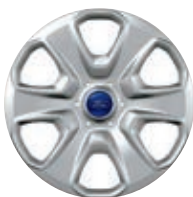
15" Steel with Silver-Painted Covers Standard: S

SiriusXM Satellite Radio with 6-month trial subscription (included on 201A)