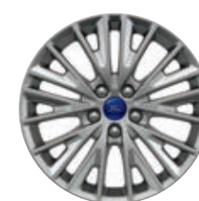
17" Sport Painted Aluminum Standard

Dual-zone electronic automatic temperature control.