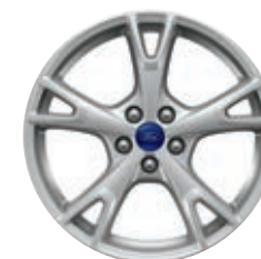
18" Premium Painted Aluminum Included: Titanium 18" Wheel Package