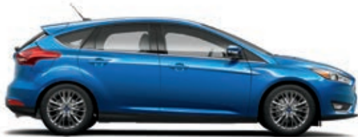
Blue Candy Metallic Tinted Clearcoat