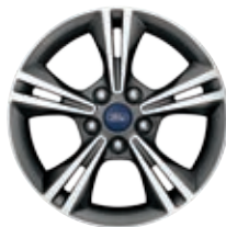
16" Machined Aluminum with Dark-Painted Pockets Included: SE EcoBoost Appearance Package