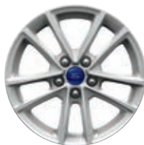
16" Painted Aluminum Standard: SE