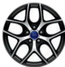
17" Machined Aluminum with Black-Painted Pockets Included: SE Sport Package