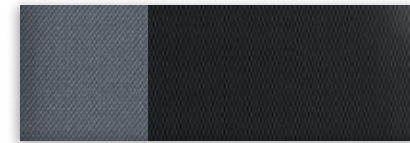
5 Charcoal Black Cloth with Anthracite Accents