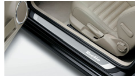
Door Sill Protection