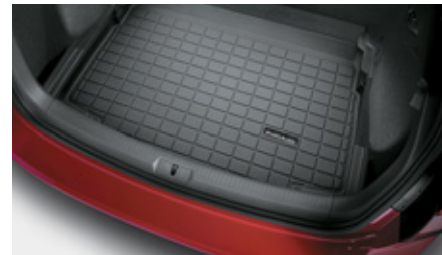
MuddyBuddy ™ Cargo Liner and CARGOTECH ® Blocks