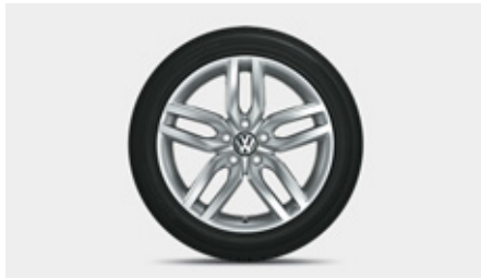
18" Helix Wheels