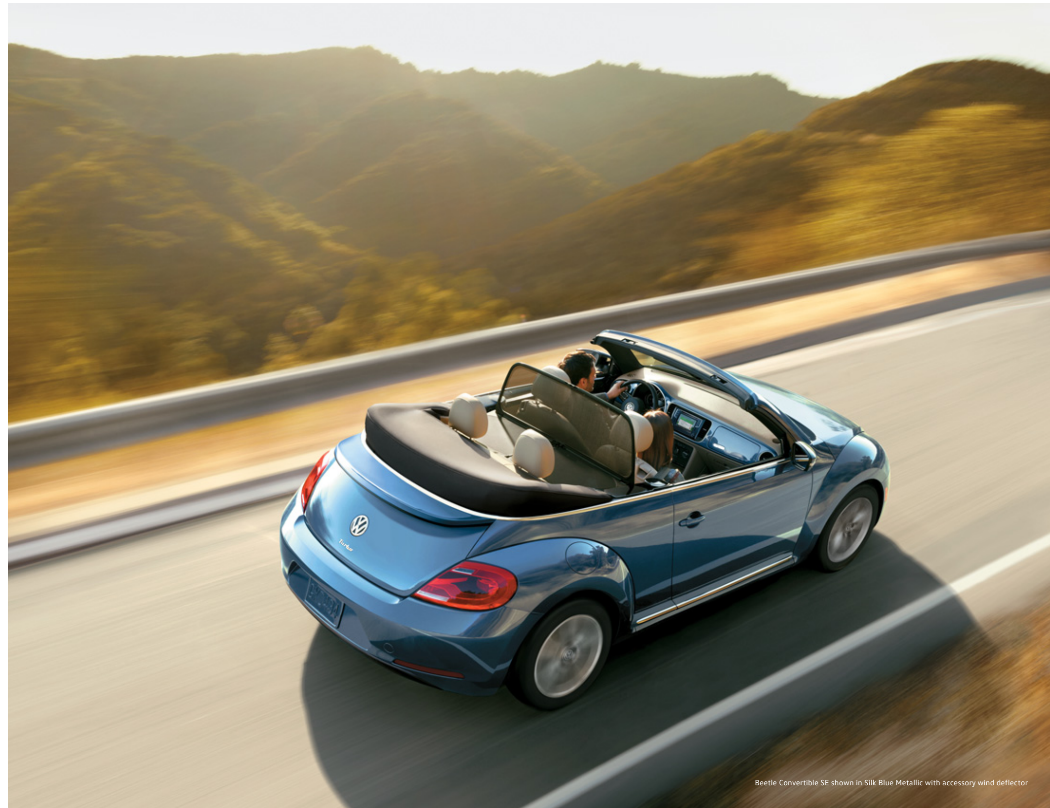
Beetle Convertible SE shown in Silk Blue Metallic with accessory wind deflector

Rearview Camera System. Hindsight is now foresight. The rearview camera helps you see and avoid obstacles when backing up, and it can make parking easier.