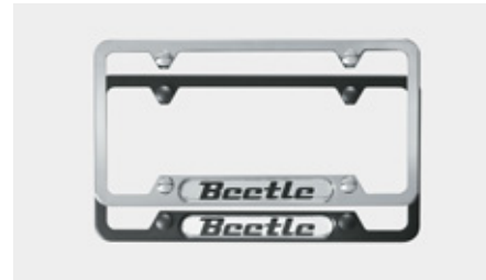
License Plate Frames