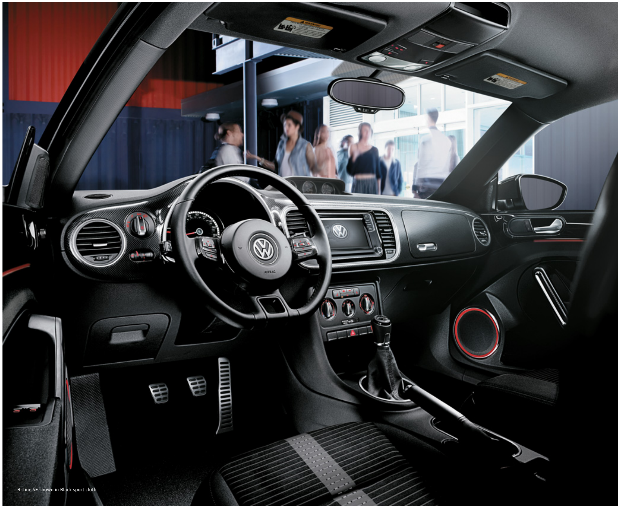
R-Line SE shown in Black sport cloth