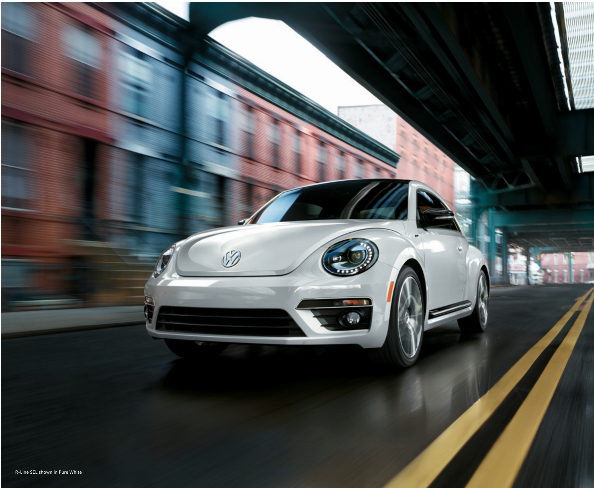
R-Line SEL shown in Pure White