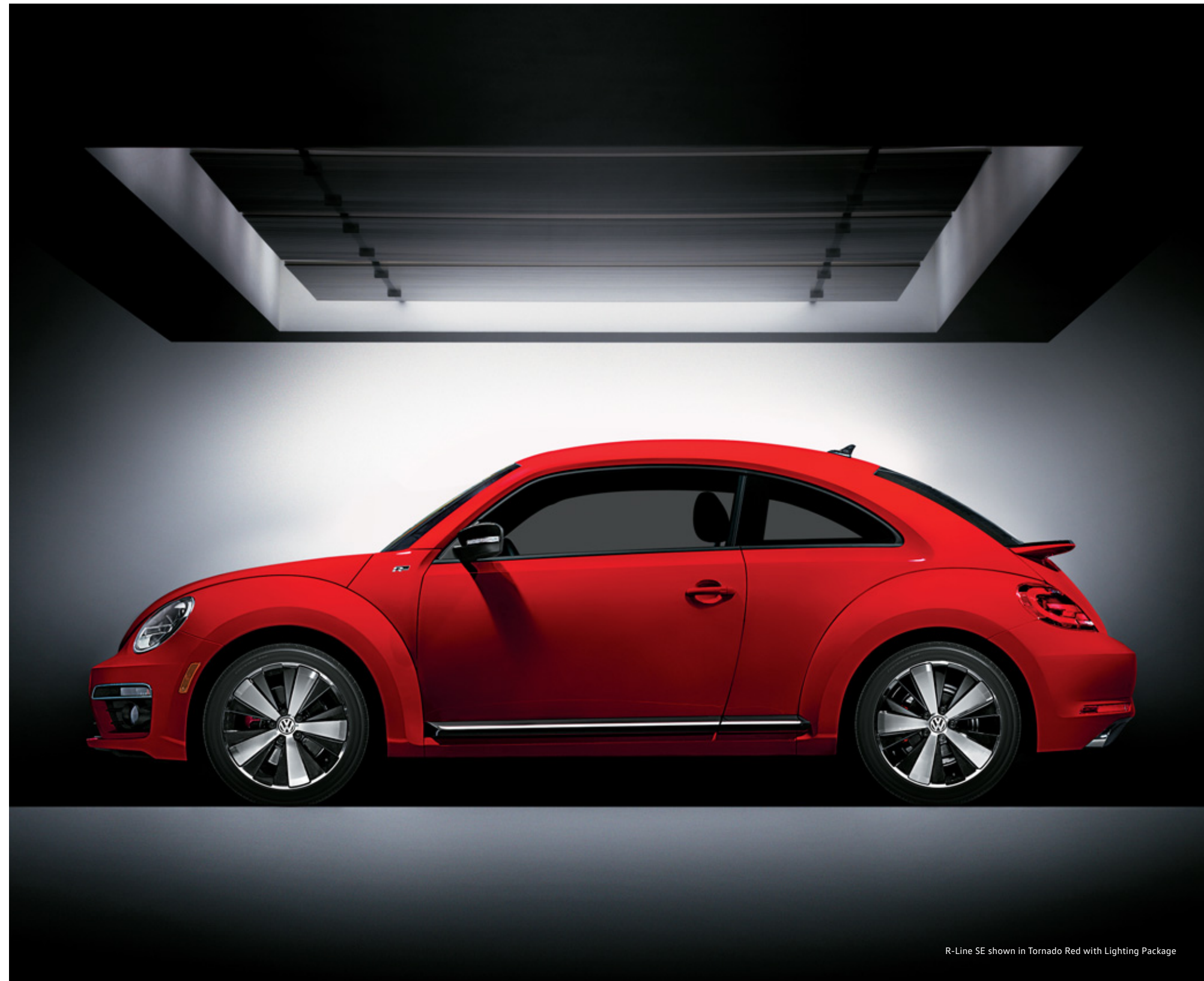
R-Line SE shown in Tornado Red with Lighting Package

19-inch alloy wheels. The Beetle is already distinctive. But that didn't stop us from designing every detail. These substantial wheels not only give your Beetle a proud stance, but their unique design lets the world know this is how you roll.