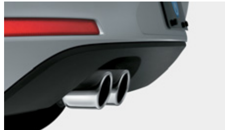
Chrome Exhaust Tips