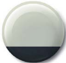
Crushed Ice/ Black Sand Pearl