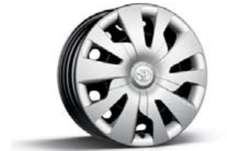
L 15-in. steel wheels with wheel covers