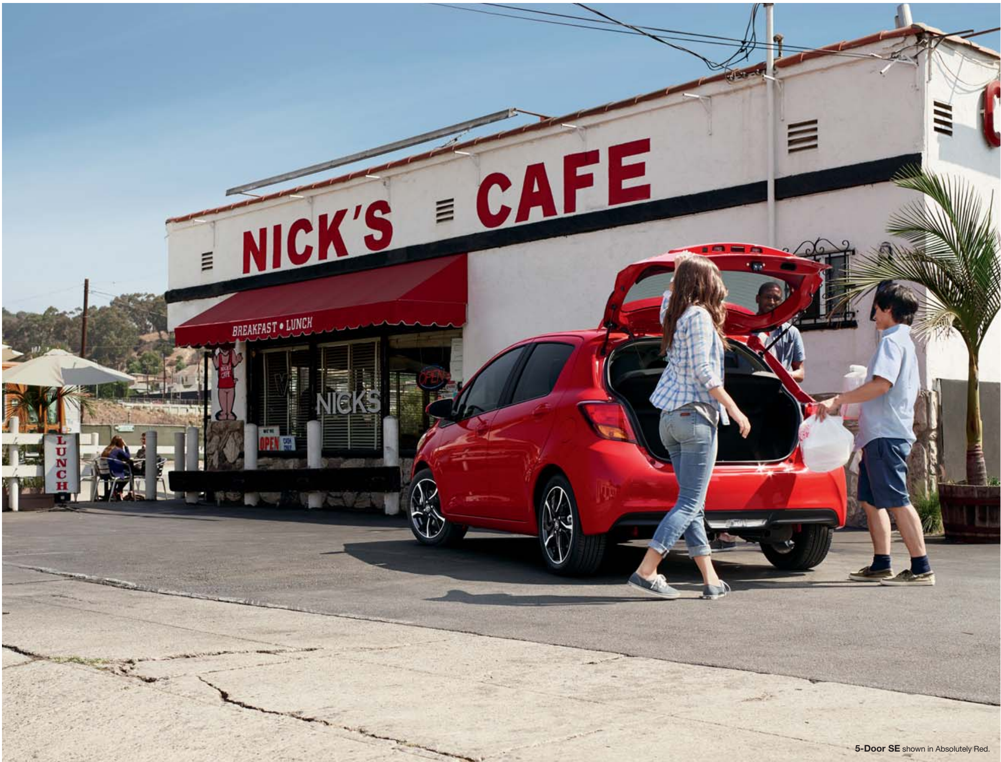
5-Door SE shown in Absolutely Red.