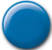
Blue Streak Metallic