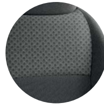
L and LE fabric shown in Black (circles)