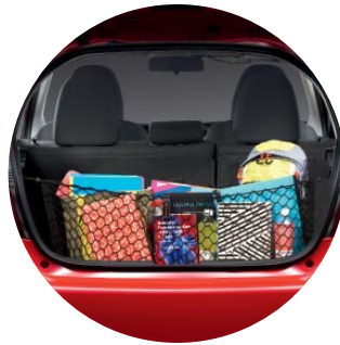
Cargo net — envelope 1