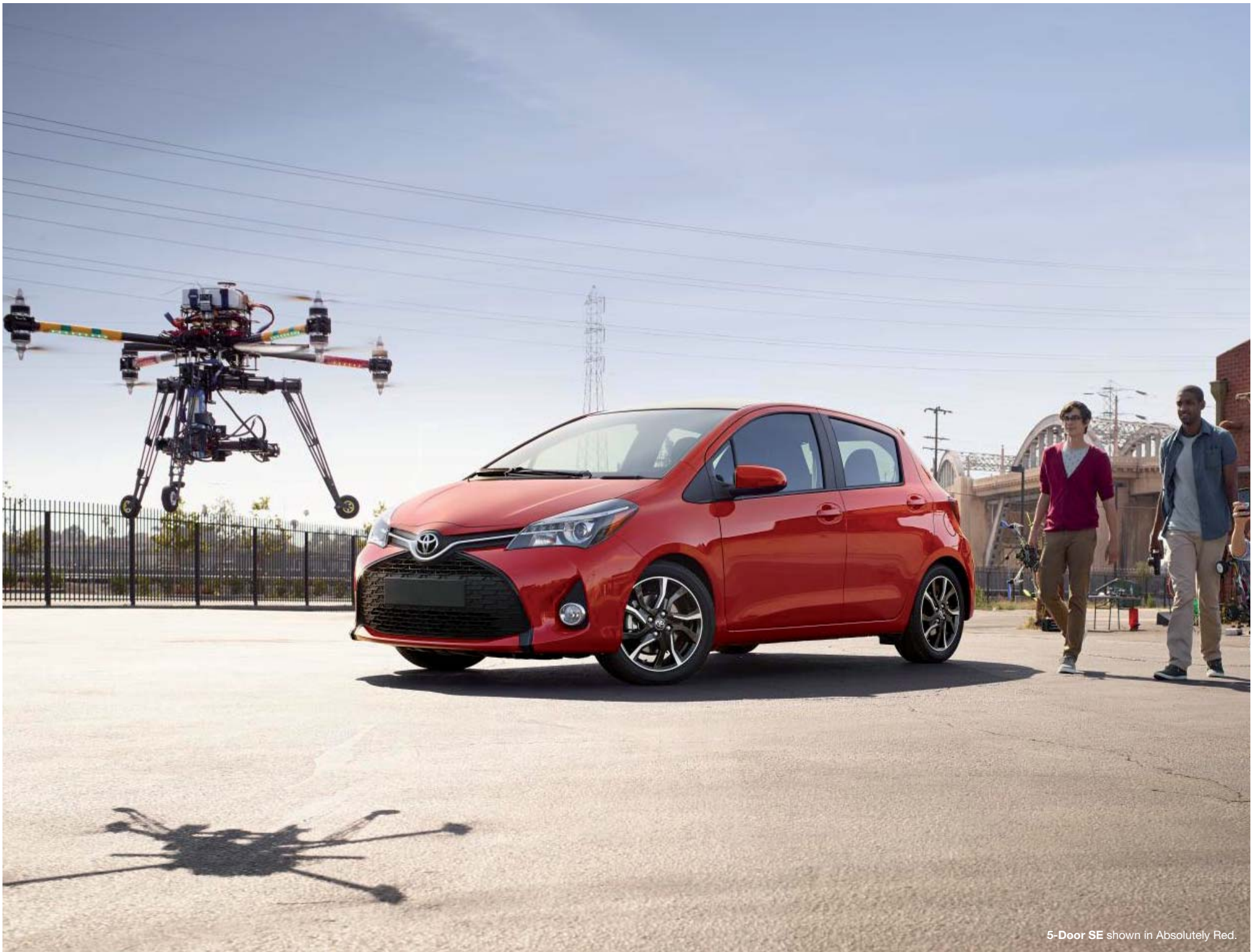
5-Door SE shown in Absolutely Red.