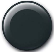
Black Sand Pearl