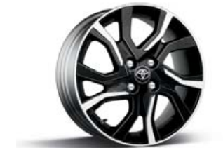
SE 16-in. machined-finish alloy wheels