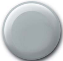
Classic Silver Metallic