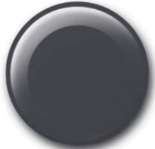
Magnetic Gray Metallic