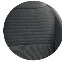
SE fabric shown in Black (channel)