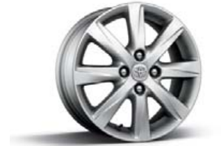
LE 15-in. alloy wheels