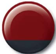
Barcelona Red Metallic/ Black Sand Pearl