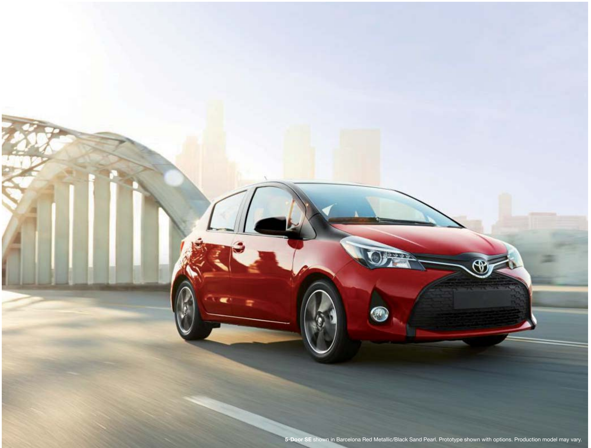
5-Door SE shown in Barcelona Red Metallic/Black Sand Pearl. Prototype shown with options. Production model may vary.