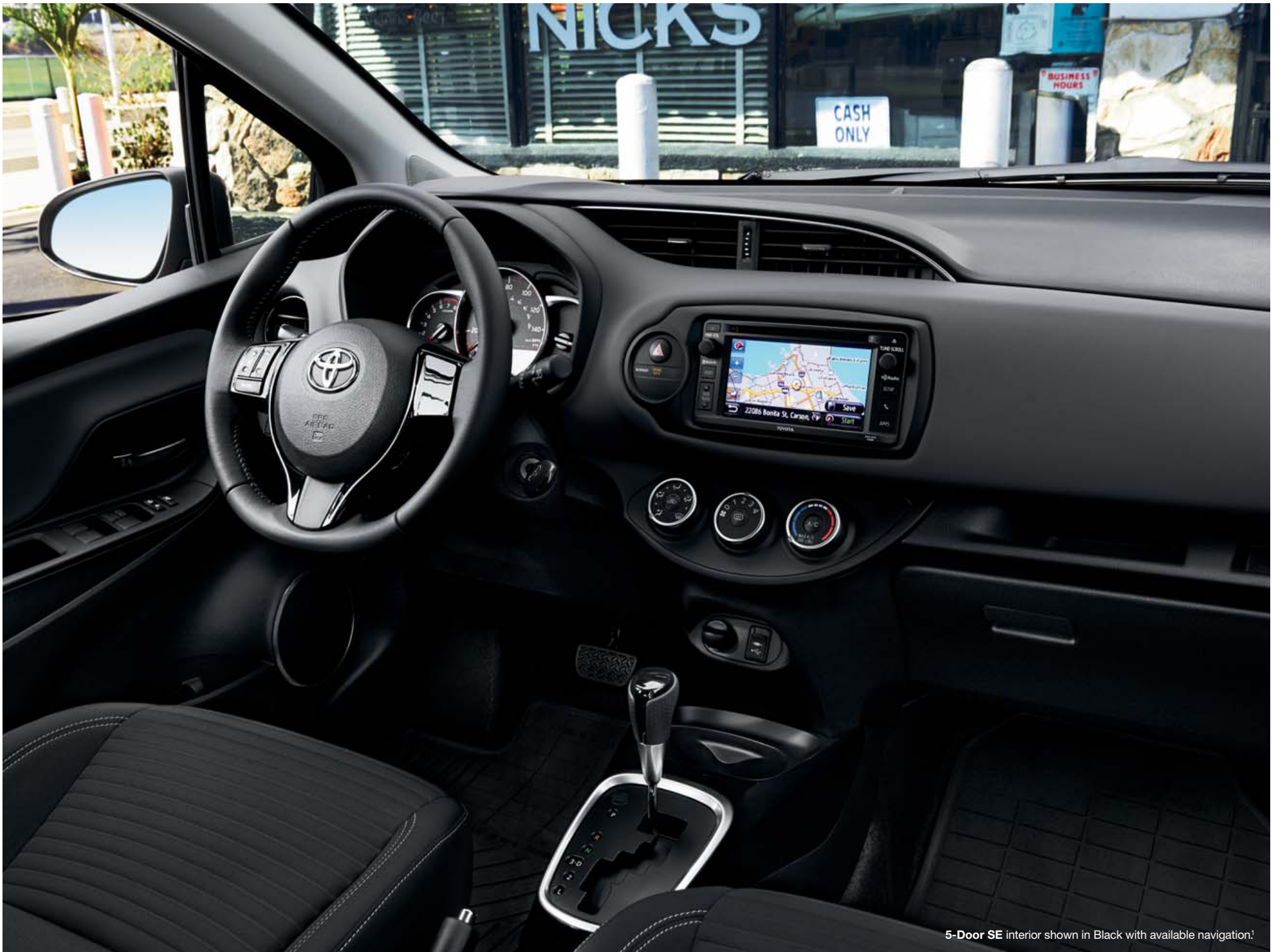
5-Door SE interior shown in Black with available navigation!