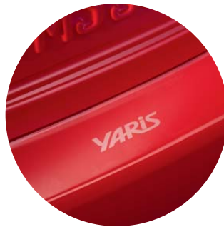
Paint protection film 3