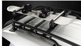
Ski/Snowboard Attachment w/ Adaptor $224 Parts Only MSRP**