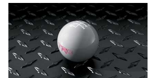
TRD Shiftknob $59 Installed MSRP*