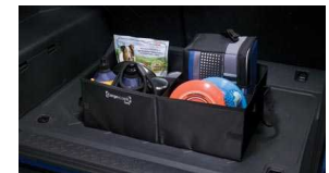
Cargo Tote $40 Parts Only MSRP**