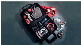
Emergency Assistance Kit $70 Installed MSRP*