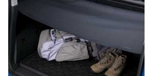
Cargo Cover $90 Installed MSRP*