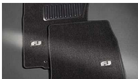
Carpet Floor Mats & Cargo Mat $199 Installed MSRP*