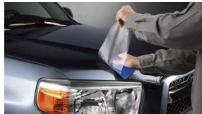
Paint Protection Film $395 Installed MSRP*