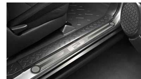
Billet Door Sills $149 Installed MSRP*