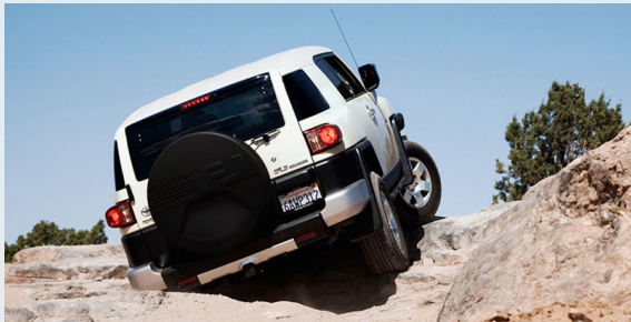
FJ Cruiser shown in Iceberg with available Upgrade Package #2. [6]