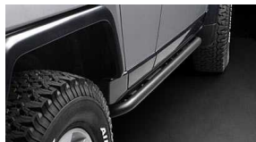
Rock Rails $575 Installed MSRP*