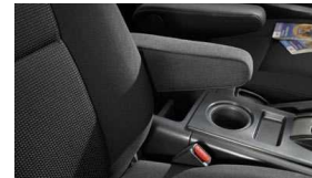
Armrest $125 Installed MSRP*