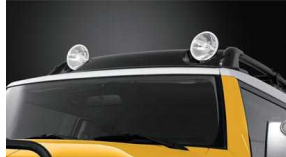
Off-Road Lights w/ Air Dam $799 Installed MSRP*