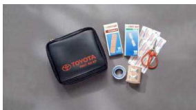
First Aid Kit $29 Installed MSRP*