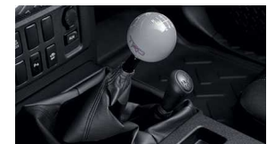
TRD Quickshifter $450 Installed MSRP*