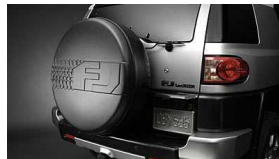
Spare Tire Cover $169 Installed MSRP*