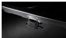
Towing Hitch & Wire Harness $349 Installed MSRP*