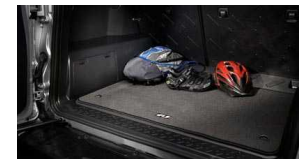
Carpet Cargo Mat $69 Parts Only MSRP**