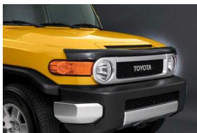
Hood Protector $155 Installed MSRP*