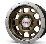
TRD 16" Off-road Beadlock Wheel $219 Parts Only MSRP**