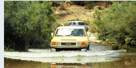
FJ Cruiser shown in Sun Fusion and Silver Fresco Metallic with accessory rock rails.