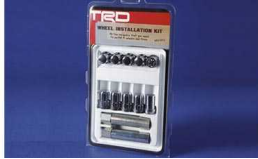
TRD Wheel Locks $150 Parts Only MSRP**