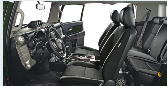
FJ Cruiser 4WD shown in Dark Charcoal with available Upgrade Package #2. 2008 model shown. [6]