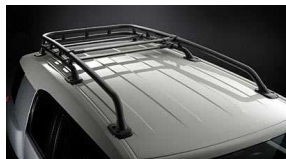
Roof Rack $649 Installed MSRP*