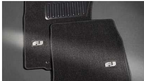
Carpet Floor Mats (4-piece set) $119 Parts Only MSRP**