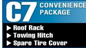
Roof Rack, Towing Hitch and Wire Harness, Spare Tire Cover $1,167 Installed MSRP*