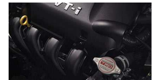
TRD Radiator Cap $37 Parts Only MSRP**