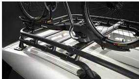
Bike Rack Attachment - w/ Adaptor $274 Parts Only MSRP**