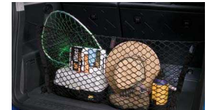
Cargo Net $49 Installed MSRP*