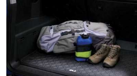
All Weather Cargo Mat $79 Parts Only MSRP**