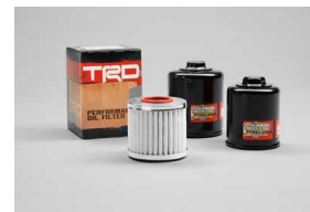
TRD Oil Filter $13 Parts Only MSRP**