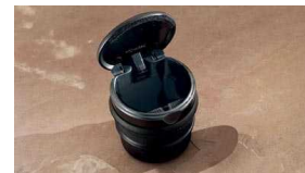
Ashtray Kit $17 Parts Only MSRP**