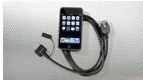
iPod Interface $299 Installed MSRP*