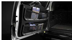
Rear Door Storage Net $89 Installed MSRP*