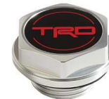
TRD Oil Cap $45 Parts Only MSRP**