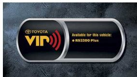
VIP Security RS3200 Plus System $479 Installed MSRP*