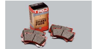
TRD Performance Brake Pads $95 Parts Only MSRP**