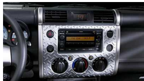
Molded Dash Applique $350 Installed MSRP*