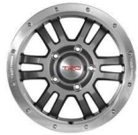
TRD 17" Forged Off-road Alloy Wheels $3,199 Installed MSRP*