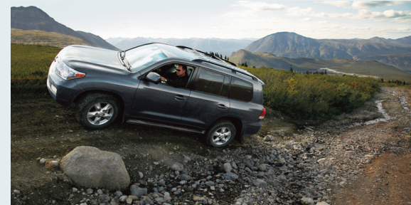
2010 Land Cruiser shown in Magnetic Gray Metallic with available Upgrade Package