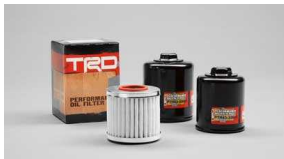
TRD Oil Filter $13 Parts Only MSRP**