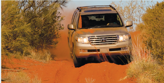
2010 Land Cruiser shown in Sonora Gold Pearl with available Upgrade Package