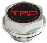
TRD Oil Cap $45 Parts Only MSRP**