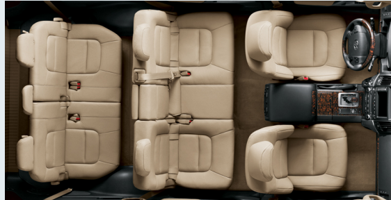
Land Cruiser interior shown in Sand Beige