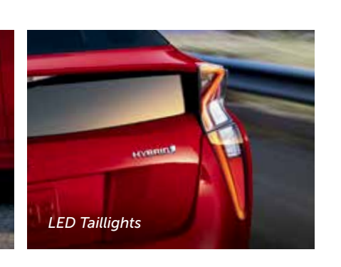
FRONT COVER Prius Touring shown in Hypersonic Red.