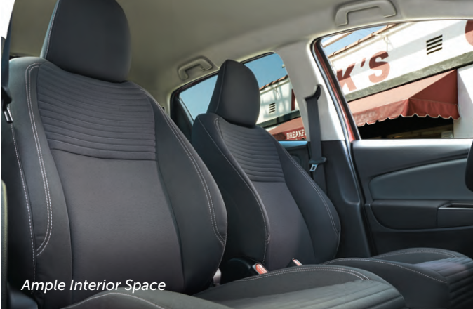
Ample Interior Space