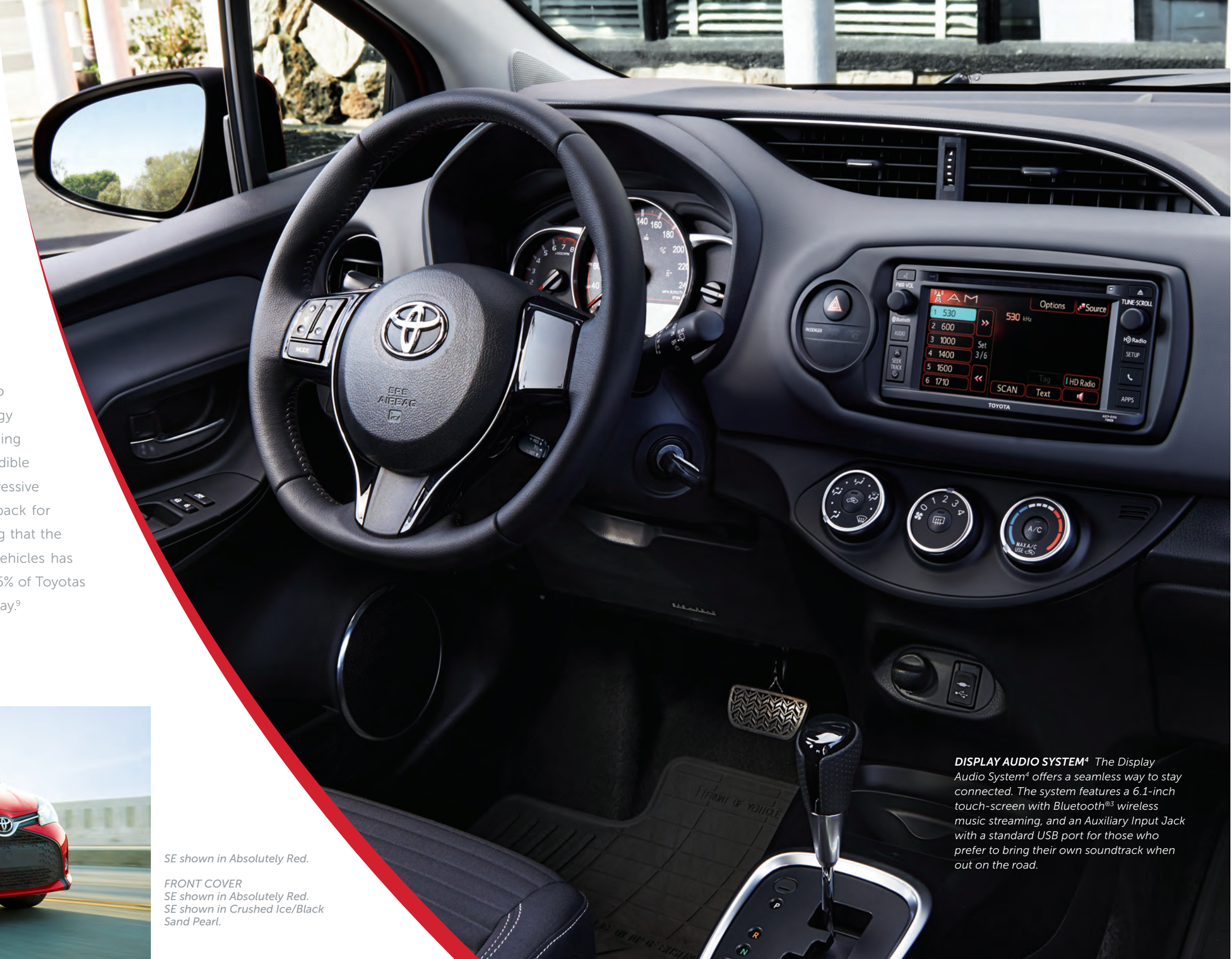
DISPLAY AUDIO SYSTEM 4 The Display Audio System 4 offers a seamless way to stay connected. The system features a 6.1-inch touch-screen with Bluetooth ®3 wireless music streaming, and an Auxiliary Input Jack with a standard USB port for those who prefer to bring their own soundtrack when out on the road.