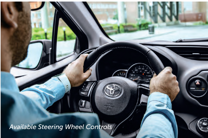
Available Steering Wheel Controls