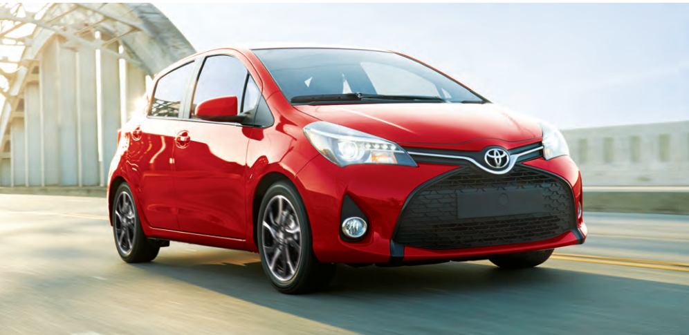
SE shown in Absolutely Red. FRONT COVER SE shown in Absolutely Red. SE shown in Crushed Ice/Black Sand Pearl.

As if the city weren't fun enough already, you can explore more of it in a vehicle that's equally exhilarating to drive. The 2016 Yaris Hatchback offers more room in your life for spontaneity, excitement, and of course - your stuff. It features an eye-catching exterior with sleek lines, distinctive accents, a masculine stance, and a stylish interior that's compact yet spacious, with fine quality materials throughout. Inside you'll also find a host of connectivity features and intuitive technology that makes getting around, talking to friends, and listening to music easier and more enjoyable than ever. With incredible handling, a small turning circle of 9.6 m (CE,LE) and impressive fuel efficiency, we challenge you to find a better hatchback for the urban landscape. You can also take comfort knowing that the same dedication to reliability that goes into all Toyota vehicles has gone into Yaris Hatchback, proven by the fact that over 85% of Toyotas sold in Canada in the last 20 years are still on the road today. 9