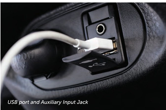
USB port and Auxiliary Input Jack