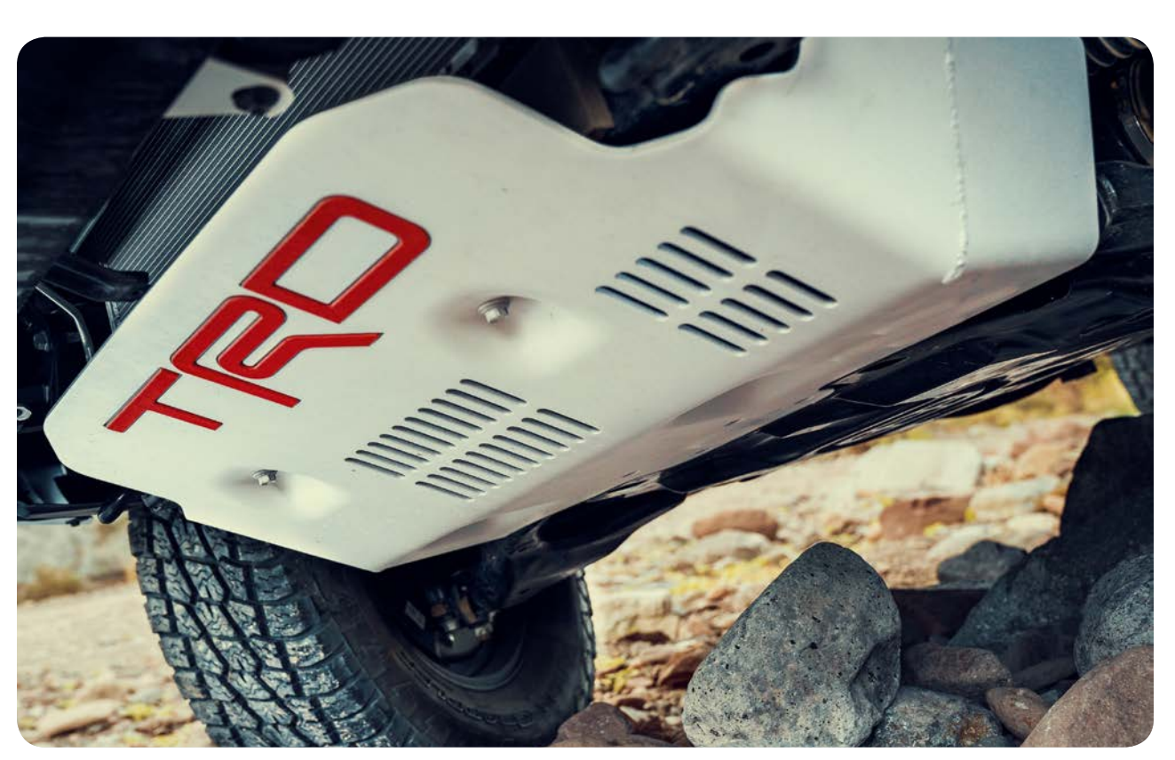
(4Runner Red Stamped Front Skid Plate shown.)