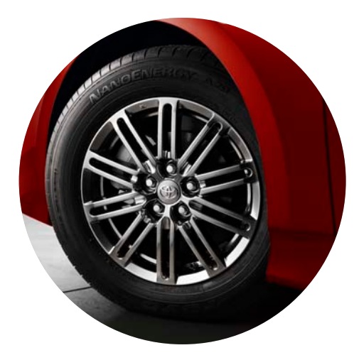
EXTERIOR Protect and highlight the sleek, aerodynamic exterior of your Prius.