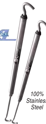
100% Stainless Steel

Designed exclusively for all frame-mounted tiedowns. The 100% Stainless Steel Springload XL turnbuckle gives a custom clean look and an inexpensive upgrade alternative to the basic springload and chain system. The Springload XL incorporates the Lifetime Guarantee FastGun internal springs and Spring Tension Indicators. Sold in sets of two with a reach of 28" to 44".