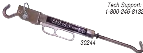
“.45”: 30244 Stainless Polished #S9527 1

Works only with bed mounted front tie downs, 14.5' - 21.5' reach. Kit includes: 2 fastgunturnbuckles.