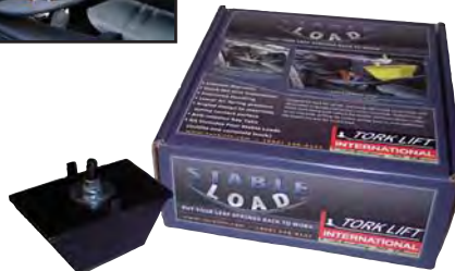
30783 Stable Load Spring Pads, set/4 #A7200 4