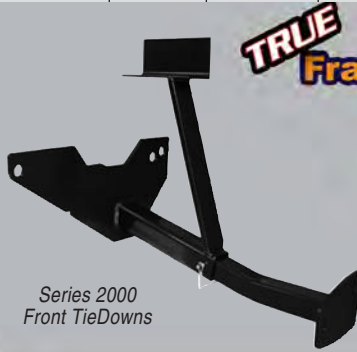
Series 2000 Front Tie Downs